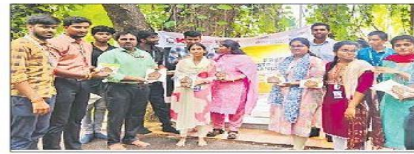
మట్టి విగ్రహాల పంపిణీ చేస్తున్న కేవలీయూ విద్యార్థులు