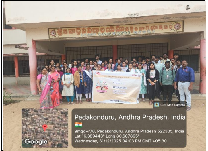
Pedakonduru, Andhra Pradesh, India 9mqq+r78, Pedakonduru, Andhra Pradesh 522305, India Lat 16.389443° Long 80.687895° Wednesday, 31/12/2025 04:03 PM GMT +05:30