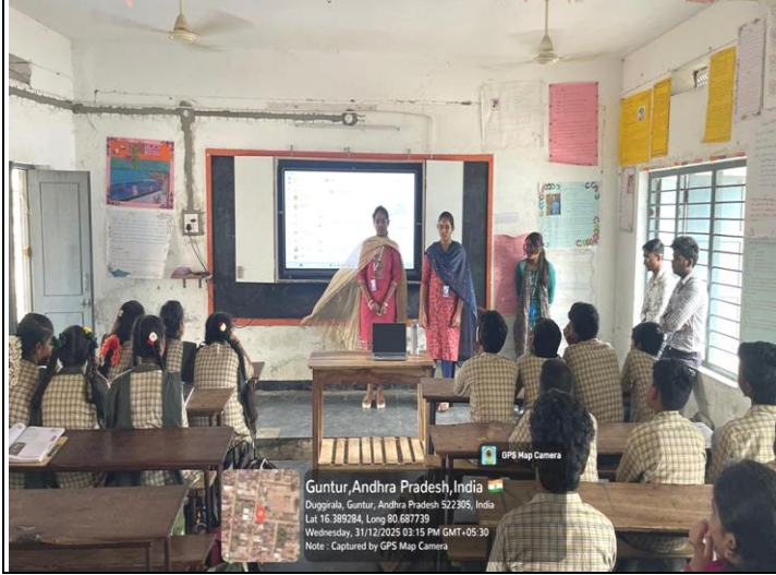
Guntur, Andhra Pradesh, India Duggirala, Guntur, Andhra Pradesh 522305, India Lat 16.389294, Long 80.687729 Wednesday, 31/12/2025 03:15 PM GMT+05:30 Note: Captured by GPS Map Camera