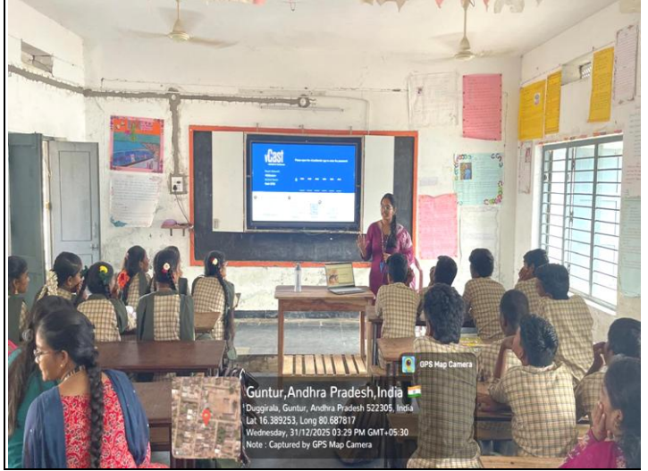
Guntur, Andhra Pradesh, India Duggirala, Guntur, Andhra Pradesh 522305, India Lat 16.389253, Long 80.687817 Wednesday, 31/12/2025 03:29 PM GMT+05:30 Note: Captured by GPS Map Camera