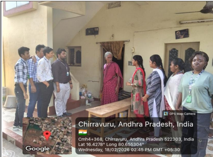
Chirravuru, Andhra Pradesh, India Cmh4+368, Chirravuru, Andhra Pradesh 522303, India Lat 16.4278° Long 80.655304° Wednesday, 18/02/2026 02:45 PM GMT +05:30