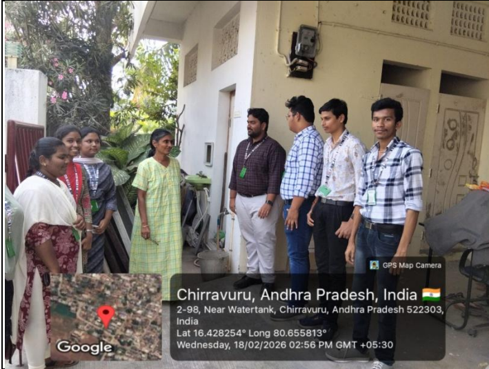
Chirravuru, Andhra Pradesh, India 2-98, Near Watertank, Chirravuru, Andhra Pradesh 522303, India Lat 16.428254° Long 80.655813° Wednesday, 18/02/2026 02:56 PM GMT +05:30