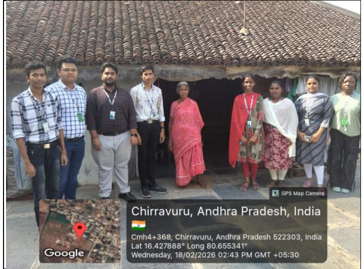
Chirravuru, Andhra Pradesh, India Cmh4+368, Chirravuru, Andhra Pradesh 522303, India Lat 16.427888° Long 80.655341° Wednesday, 18/02/2026 02:43 PM GMT +05:30