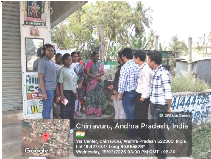
Chirravuru, Andhra Pradesh, India Ysr Center, Chirravuru, Andhra Pradesh 522303, India Lat 16.427434° Long 80.655878° Wednesday, 18/02/2026 03:00 PM GMT +05:30