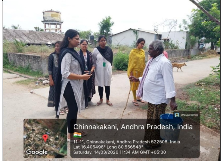
Chinnakakani, Andhra Pradesh, India

11-11, Chinnakakani, Andhra Pradesh 522508, India Lat 16.405496° Long 80.556548° Saturday, 14/03/2026 11:34 AM GMT +05:30