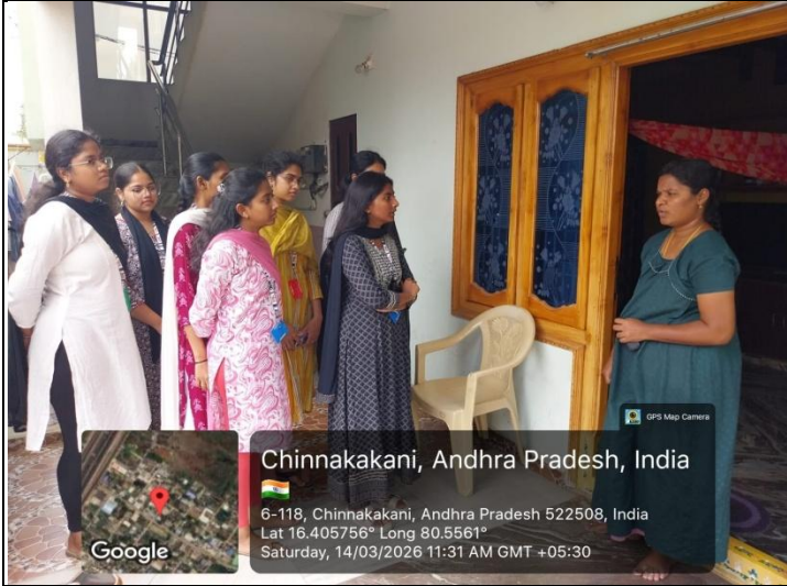
Chinnakakani, Andhra Pradesh, India

6-118, Chinnakakani, Andhra Pradesh 522508, India Lat 16.405756° Long 80.5561° Saturday, 14/03/2026 11:31 AM GMT +05:30