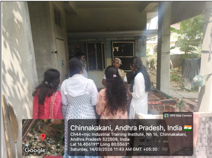
Chinnakakani, Andhra Pradesh, India

Ch44+mjc Industrial Training Institute, Nh 16, Chinnakakani, Andhra Pradesh 522508, India Lat 16.406191° Long 80.5563° Saturday, 14/03/2026 11:43 AM GMT +05:30