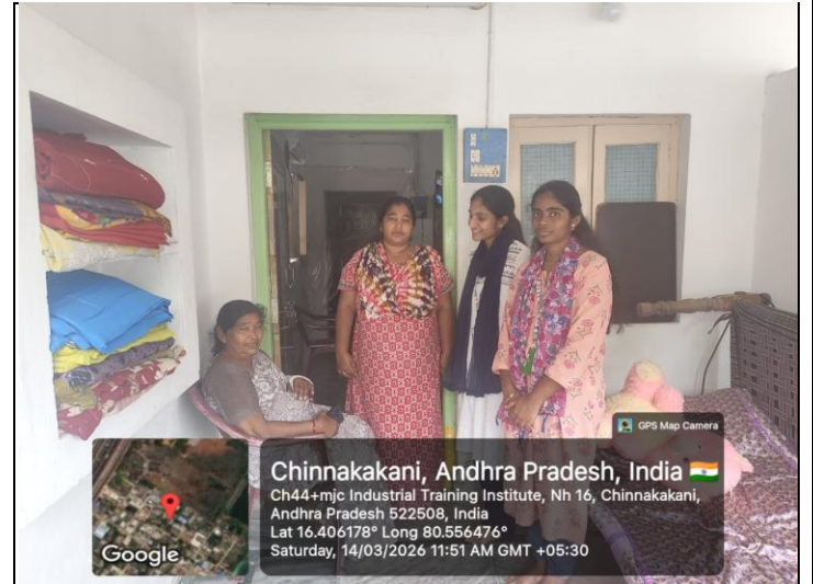
Chinnakakani, Andhra Pradesh, India

Ch44+mjc Industrial Training Institute, Nh 16, Chinnakakani, Andhra Pradesh 522508, India Lat 16.406178° Long 80.556476° Saturday, 14/03/2026 11:51 AM GMT +05:30