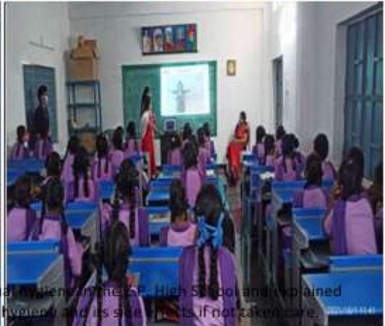
The KLEF-GEA team conducted an event on menstrual hygiene in the Z.P. High School and explained to the students about the importance of menstrual hygiene and its side effects if not taken care.