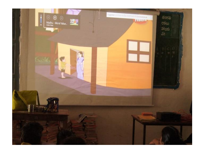
Motivational Videos on Literacy

At the end of this program people in the village were able to know the importance of literacy and its uses indaily life and also the Head of the school appreciated our CEA team for doing this which is going to be very helpful for students