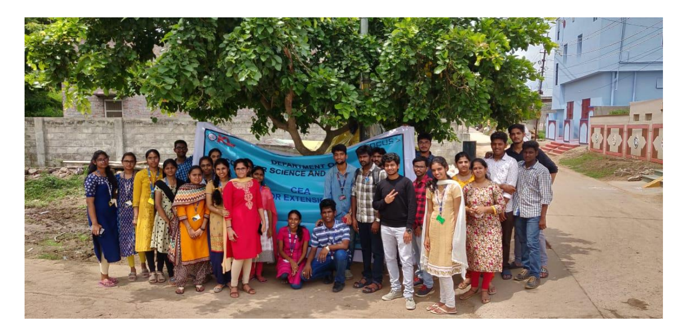
Students who participated in creating awareness on the internet usages.

At the end of this program people in the village were able to know the importance of internet and how to use it in different aspects in their daily life.and also the president of the vilage apreciated our CEA team for doing this which is going to be very helpful for them People who were there in village received team members very well and they are very interested to listen what our team members are saying and to learn the things which they were showing .they were happy that learning this is very helpful to them in their daily life.