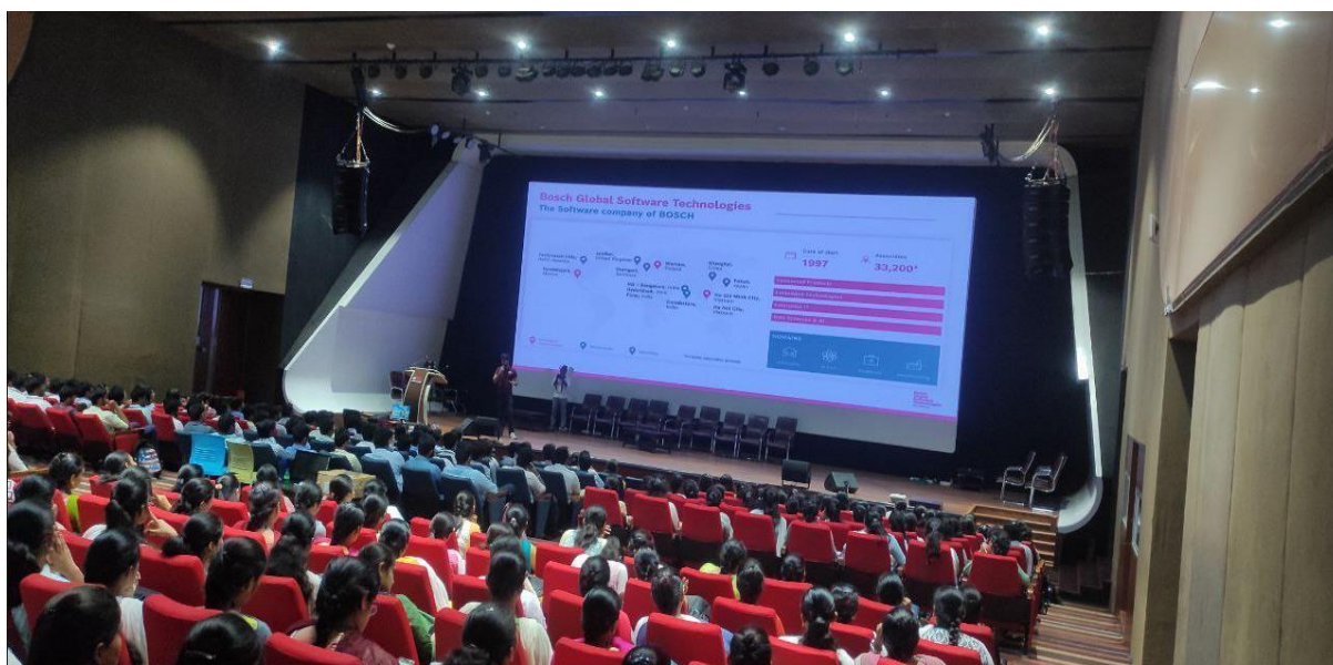
Fig: gathering during the Digital Filing: Methods and Approaches on 25.01.2019