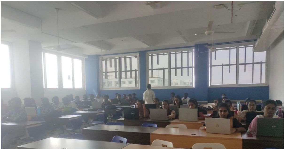
Fig: Expert talk/Seminar on Secure multicast routing protocol in MANETS on 08-10-2021