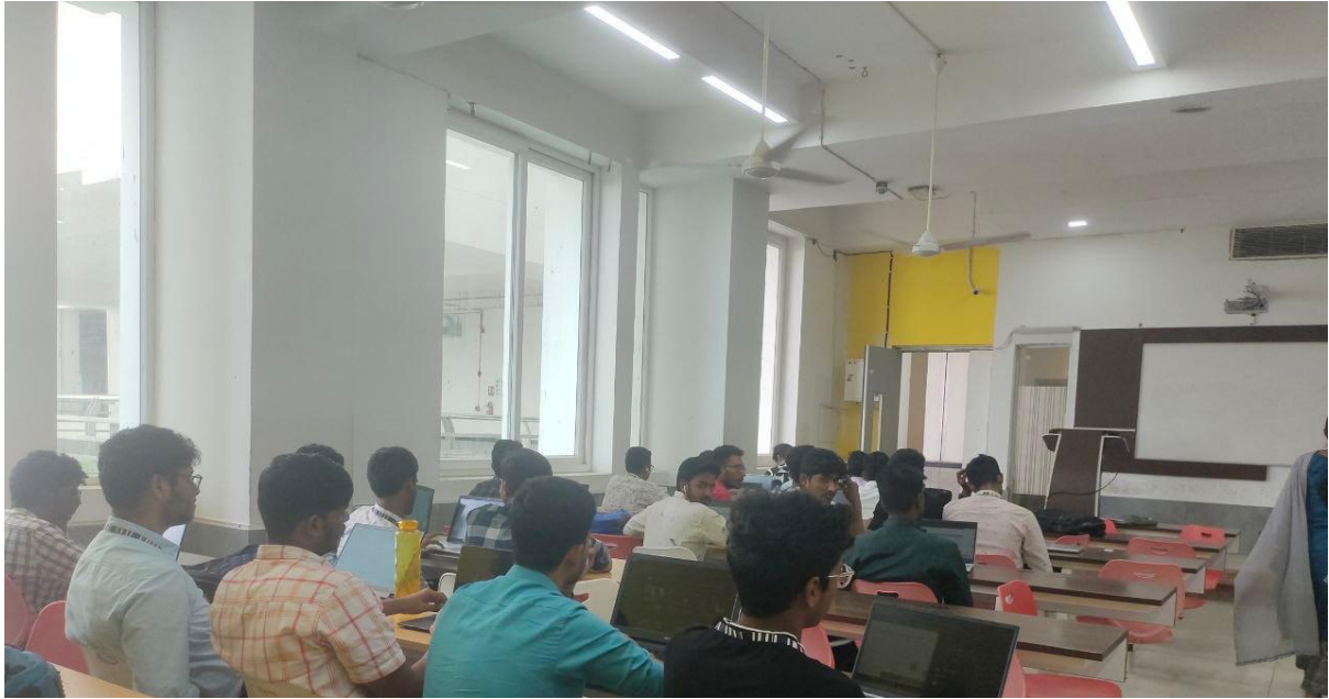
Expert talk on Data Visualization with Tableau on 10-10-2021