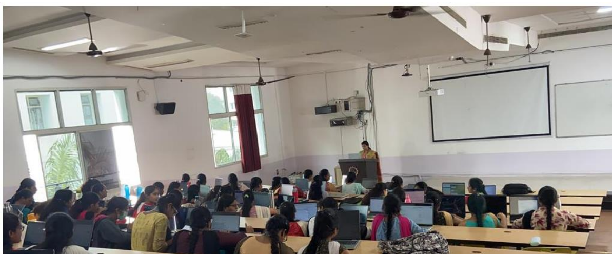
Fig: Y20 SDP-1 HACKATHON 2021 on 04-12-2021 - 05-12-2021