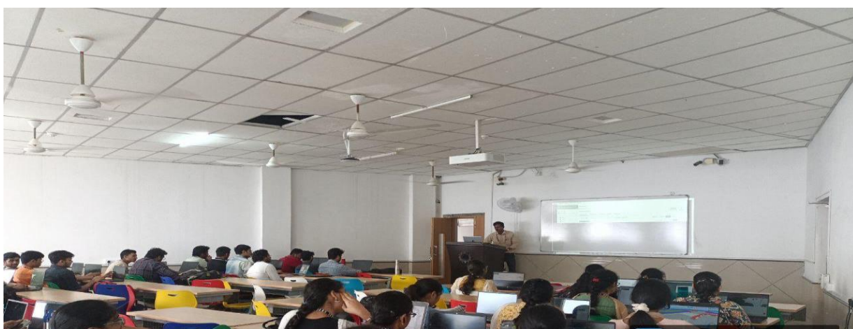
Fig: Students are watching the presentation of the guest Talk on 28-12-2021