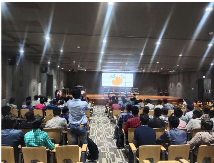
Fig: Expert talk/ Seminar - Elderly Healthcare Monitoring on 05-01-2022