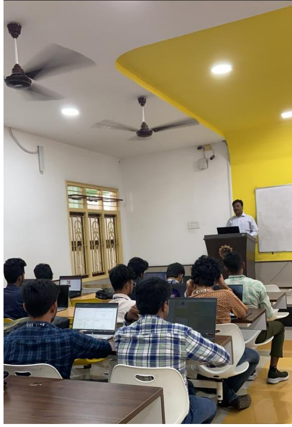
Fig: Seminar on Blind Coding on 09-02-2022