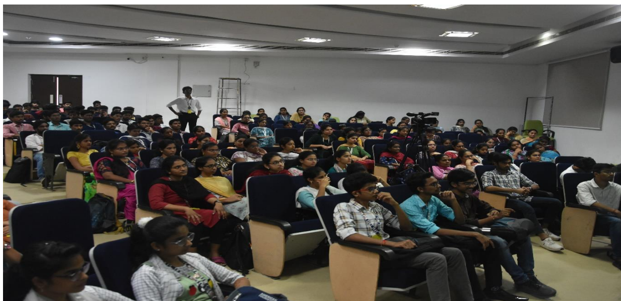
Fig: Students listening to the presentation of the expert Talk on 25.07.2021