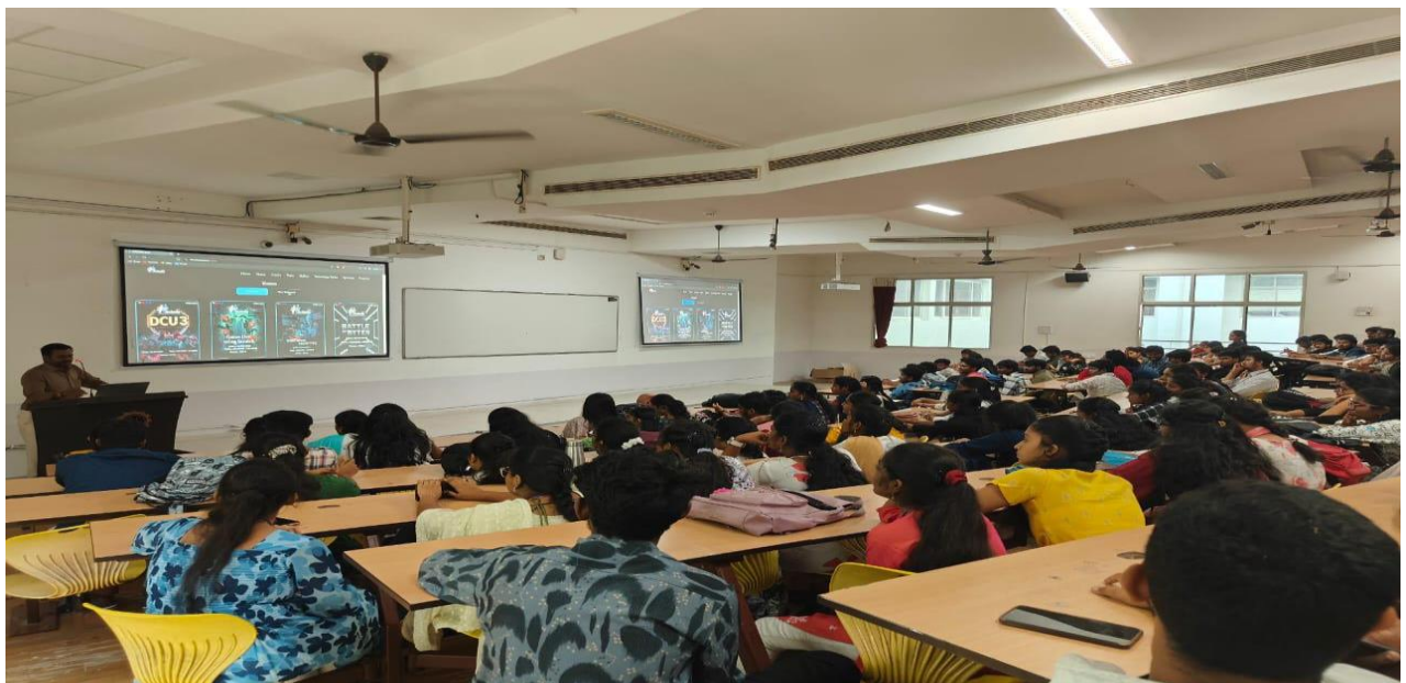
Fig: Students listening to the presentation of the expert Talk on 03.08.2021