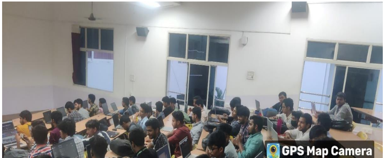
Fig: Hands on session by students on 3D model designing on 01.03.2023