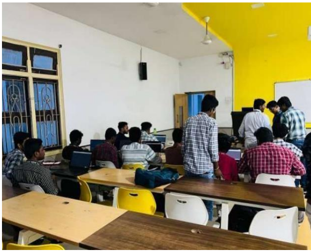
Fig1- A Seminar on Django @ 03/08/2022