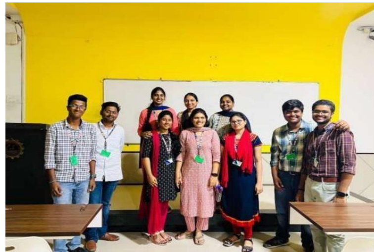
Fig2- Students are participated as groups@ 03/08/2022.