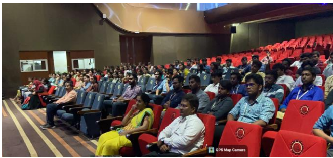
Fig-3 Student participation in seminar