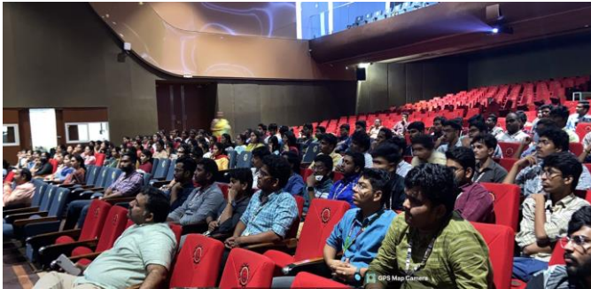
Fig4- Student participated in AWS Cloud Practitioner