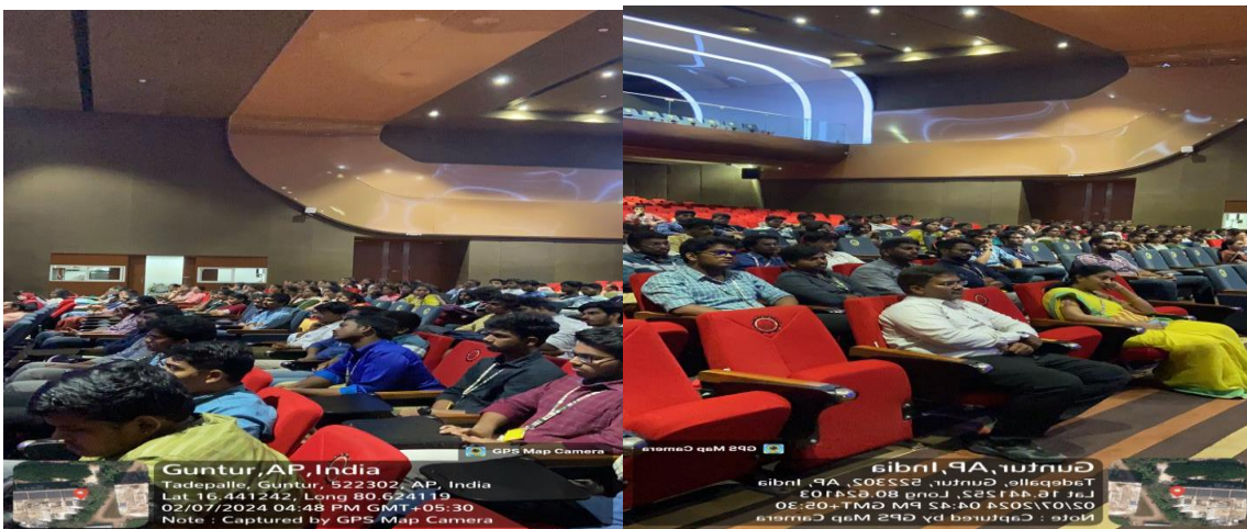
Fig- Q&A Session in the Cloud Infrastructure Services Session

The session concluded with a Q&A segment, allowing students to seek clarification on course details, certification pathways, and career prospects in cloud computing. Professor Vege addressed the queries with precision, providing valuable guidance to the students and encouraging them to embark on their journey towards becoming proficient cloud practitioners.