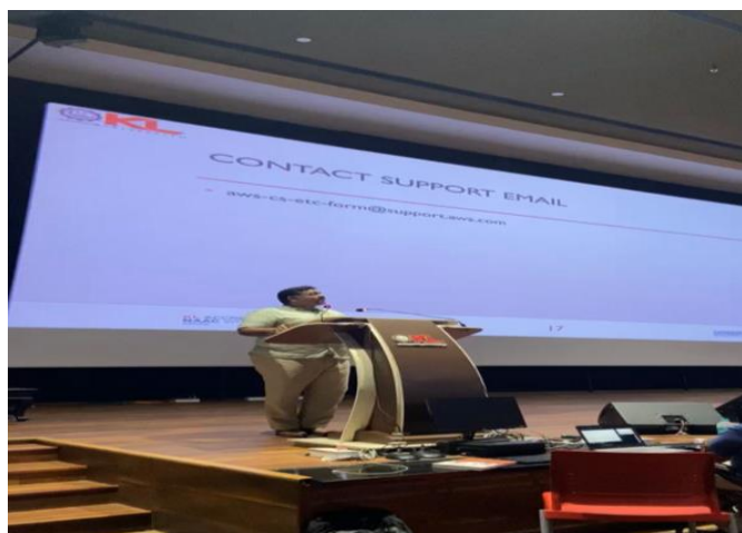
Fig1- session conducted on Cloud Infrastructure and services