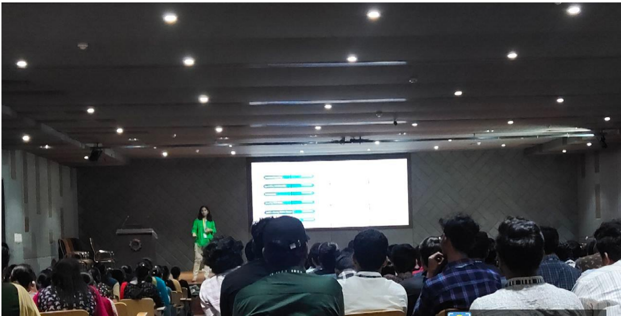
Fig2-Student participated in Question & Answer Session @10.03.2023