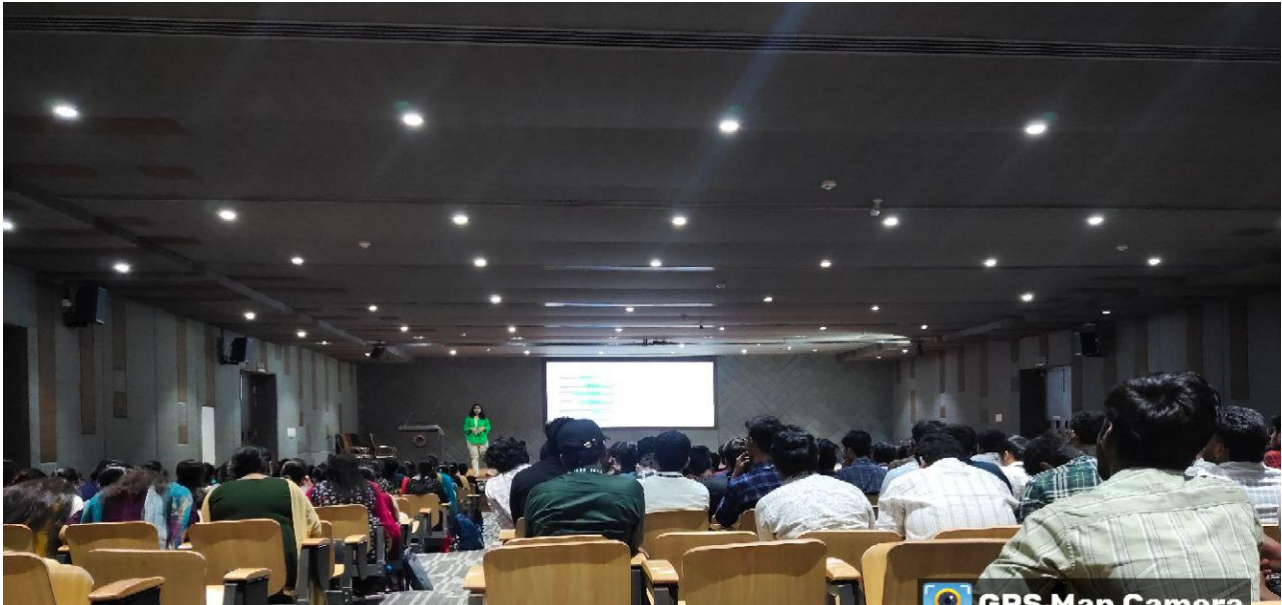
Fig- Students participated in the seminar L&T Mindtree and ServiceNow in Industry @ 10.03.2023