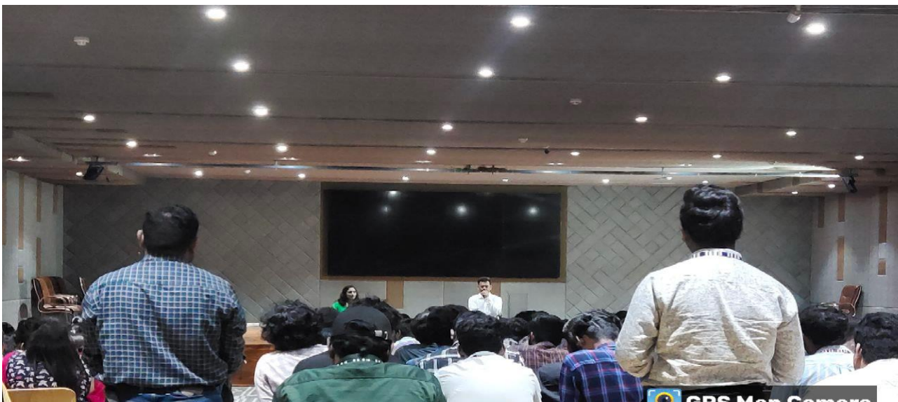
Fig3- Interactive Q&A Session conducted@10.03.2023

Following the presentations, an interactive Q&A session was conducted, allowing students to clarify their doubts and seek advice from the speakers. Topics ranged from technical queries about software development to inquiries regarding career prospects and skill requirements in the IT industry.