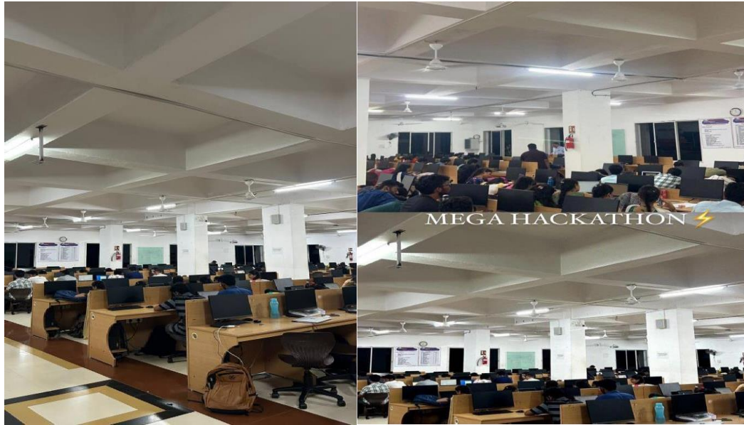
Fig2: students actively participate in Hackathon @ 04.01.2023 & 05.01.2023

Although the Y21 and Y22 Mega Hackathon was executed smoothly, it was not without its fair share of challenges. Participants encountered various obstacles that put their skills and perseverance to the test. These challenges encompassed tight deadlines, technical hurdles, and creative roadblocks, creating an environment that demanded adaptability and innovation. While these challenges may have seemed daunting, they presented invaluable learning opportunities for the students.