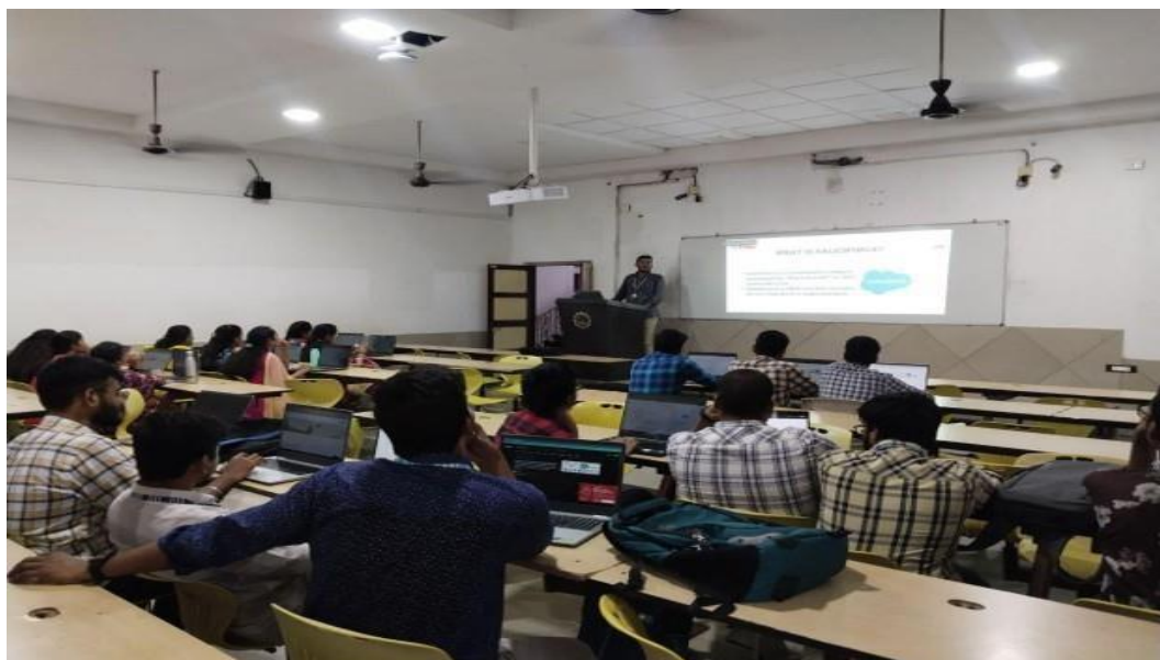
Fig: Participants listening to the Presentation by the Expert