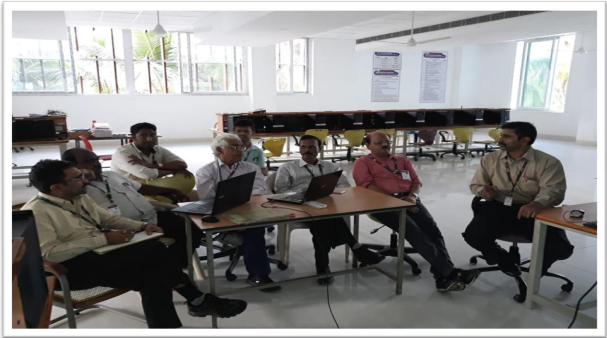
ECE faculty at R204 in the LTC training session