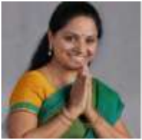
Smt. K. Kavitha Member of Parliament