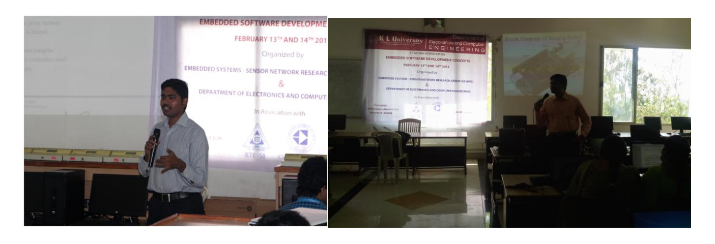
Mr.K.Rama Krishna Addressing the gathering

Second day of the workshop focused on the Introduction to ARM processor using Beagle board black, Cross compiling application and porting to ARM board, Cross compiling application and porting to ARM board with Eclipse IDE, Debug remote application on Beagle board using Eclipse IDE.