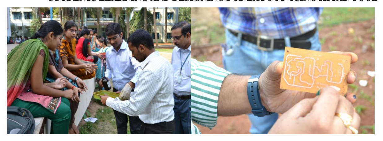
ETCHING OF PCB BY STUDENTS