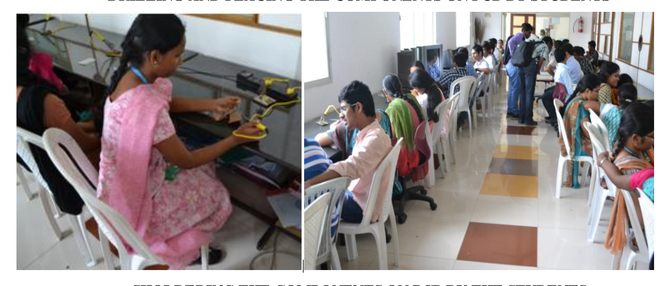
SHOLDERING THE COMPONENTS ON PCB BY THE STUDENTS