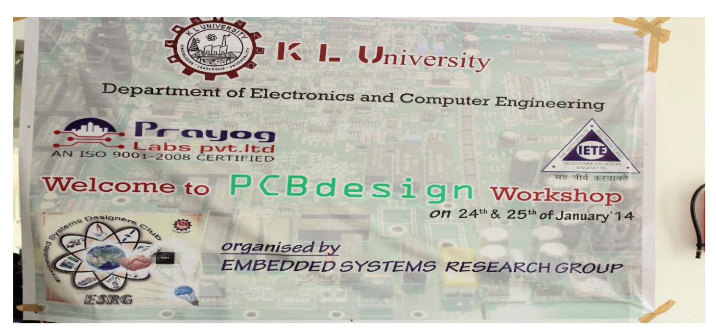
WORKSHOP ON PCB DESIGN