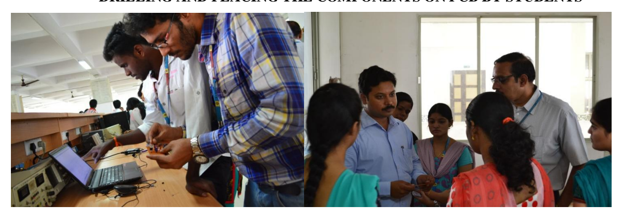
DRILLING AND PLACING THE COMPONENTS ON PCB BY STUDENTS