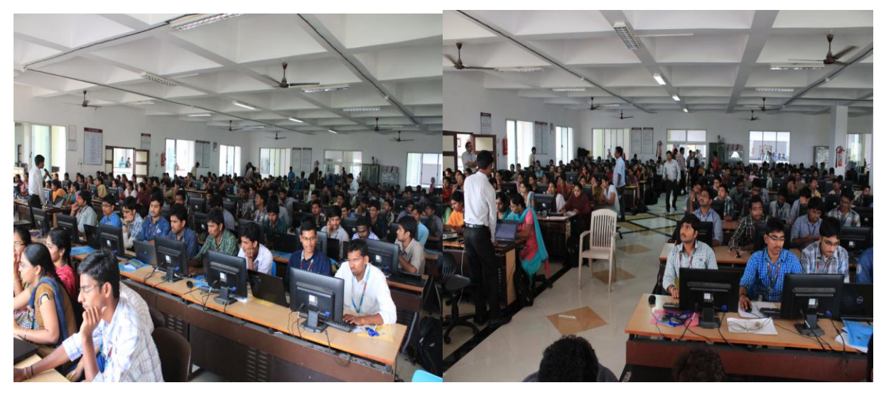
STUDENTS LEARNING AND DESIGNING PCB LAYOUT USING KICAD TOOL