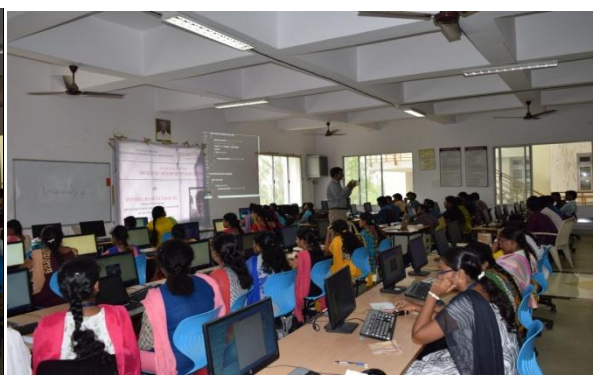
Students participation in the workshop