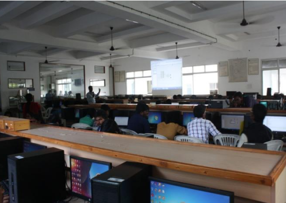
Students participation in the workshop