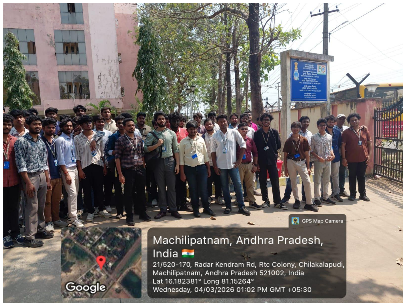
India Meteorological Department DWR Radar Station Machilipatnam

The program commenced with an introductory session on the India Meteorological Department, its history, organizational structure, and significance in the nation's socio-economic development. Officials from IMD briefed the students about the department's objectives, data collection networks, and the importance of meteorological observations in day-to-day life and national planning. The discussion also highlighted IMD's role in climate monitoring, disaster preparedness, and scientific innovation within the field of weather forecasting.