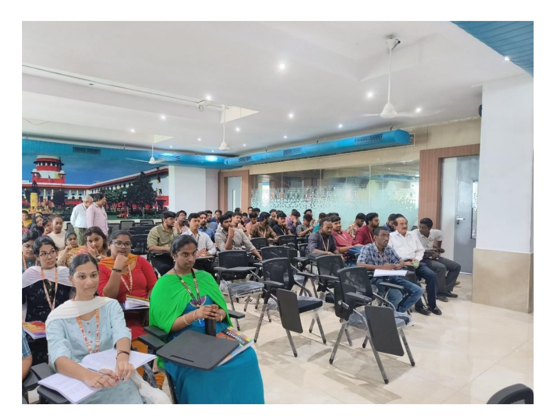
Figure 1 Students Participating in the Guest Lecture