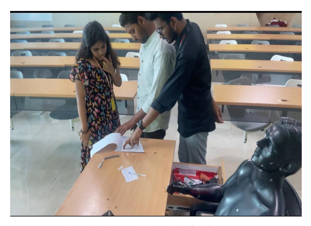
Figure 1 Crime-Scene Investigation Being Conducted