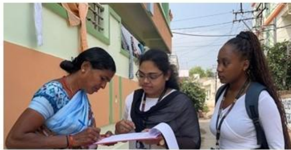
Making a note of their legal issues and spreading awareness about Nyayabandhu Legal Services and KLEF Pro Bono Club