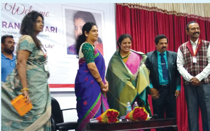
Felicitating Smt. D. Purandeswari, Former Minister of State for HRD, Government of India @ Peacock hall

On 11 th August 2018, KL Business School organized a "face to face with Achiever" program for MBA & BBA students with Smt. D. Purandeswari, Former Minister of State for HRD, Government of India. Former Union Minister and BJP national leader Daggubati Purandeswari stated that the classroom will mould the students as future citizens of the country and urged the students to use education as a weapon to solve the problems in the society. She advised the students to work hard to rise up in life and stressed the need to develop character and discipline. Stressing that women in India need a huge support beyond just education, Ms. Purandeswari said that girls should be supported in all aspects and families should raise girl children in a manner breaking the stereotypes of the society.