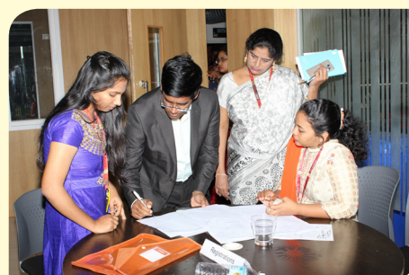
EDP session in progress