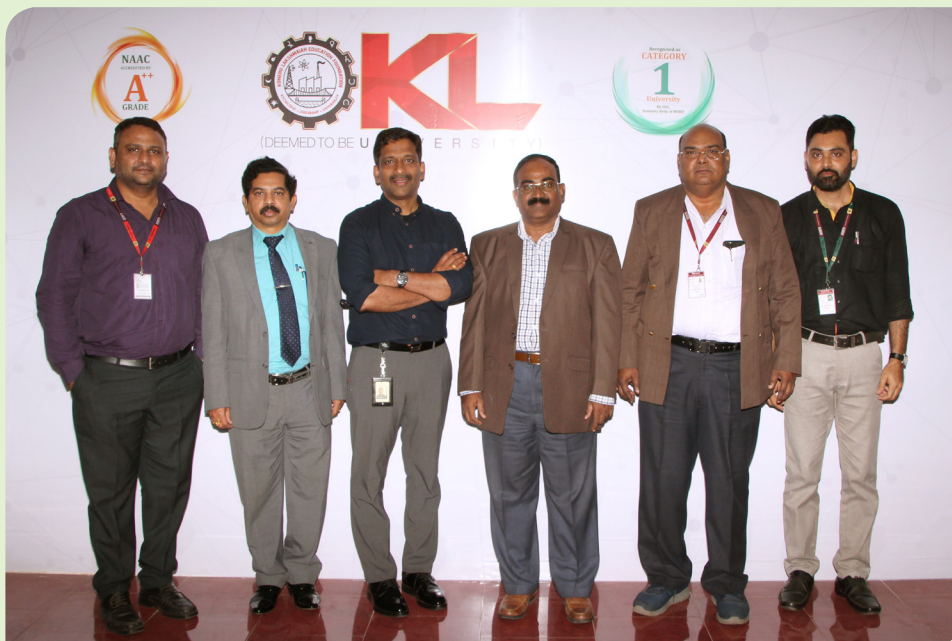
A session on Optimization of Human resources was held focusing on the education

The two hour session was very effective and it was a two way interaction. All the participants were motivated by the guest throughout his lecture.