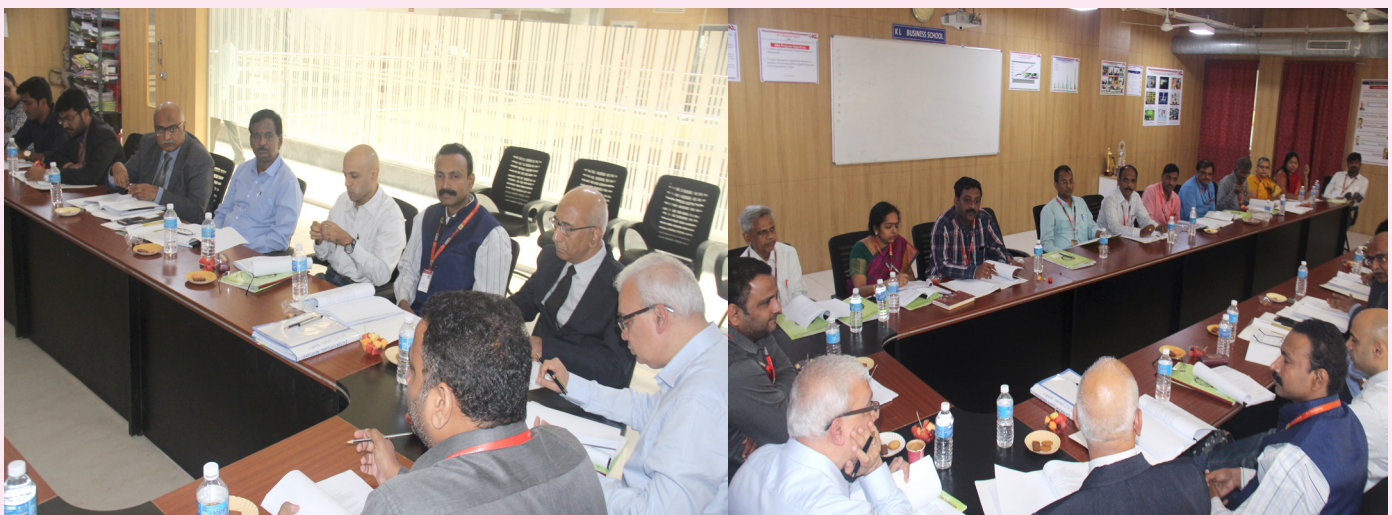
BOS meeting; where intensive discussions on MBA & BBA core syllabus were on...

Members extended their valuable suggestions and recommendations for enriching the curriculum of MBA and BBA Programs.