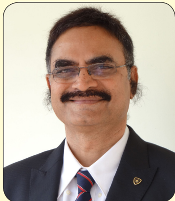
KLBS: The Department Known To Build Pioneer Personalities

Once again I am happy to see the second issue of KLBS newsletter unfolding. KLBS is the department known to nurture and build pioneer personalities. It can be seen from the various programmes covered yet again in this current issue of the newsletter which is the need of the hour. I wish all the very best to KLBS in spearheading a prominent role in nurturing and building budding personalities and bridging the gap between industry and academia.