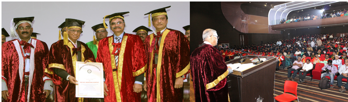
Sri N.R. Narayana Murthy awarded Doctor of Science @ VIII KLU convocation

He compared two Indians where one is privileged having access to education and the other who is still in deep poverty, illiteracy, ill health and malnutrition. Yet stated there is hope today to solve this problem but for that, we need to try hard and make short term sacrifices for long term glory. Thereby, maintaining the idealism, confidence, hope, energy and enthusiasm of every Indian, which is mandatory if we have to make good of all the dreams of the founding fathers of this country. He expressed his faith in the passing out graduates, their optimism and courage and asked them to lead by example. While doing so, he stressed to have fun because a happy mind will achieve great things. He concluded his address by praying God to give strength and most importantly character to the youngsters to make India succeed.