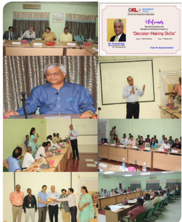
An envelope of activities conducted during this MDP

The participants were from organizations like J.C. Bio Tech, Safe Environ, Ramesh Hospital, Hindustan Coca-cola Beverages, Jasper Automobiles (P) Ltd., Isthwriwala, Hotel Tanmayi Inn, Prashanth Hospital and Devi Industries.