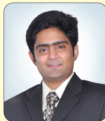
KLBS and its contribution to the Indian Industry

Therefore, SIP undertaken with all the seriousness provides an excellent learning opportunity to the Intern and also paves the way for pre- placement.