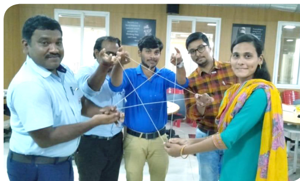
Participants indulging in Management Game