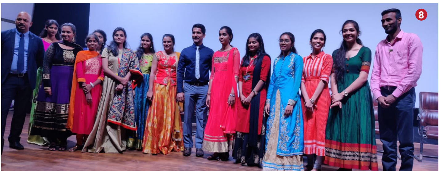
1. KMV Group 2. L&T Realty 3. Centre Hospitalo-Universitaire De Kamenge 4. L&T Technology 5. L&T Technology 6. Shapoorji Pallonji Park West 7. Volkswagen 8. Sri Ram Life Insurance