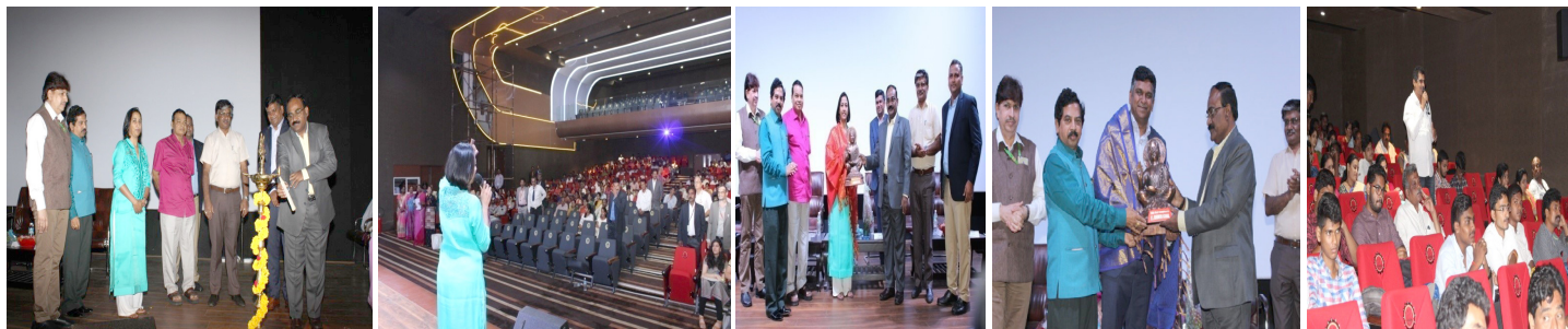
Eminent personalities who graced the occasion