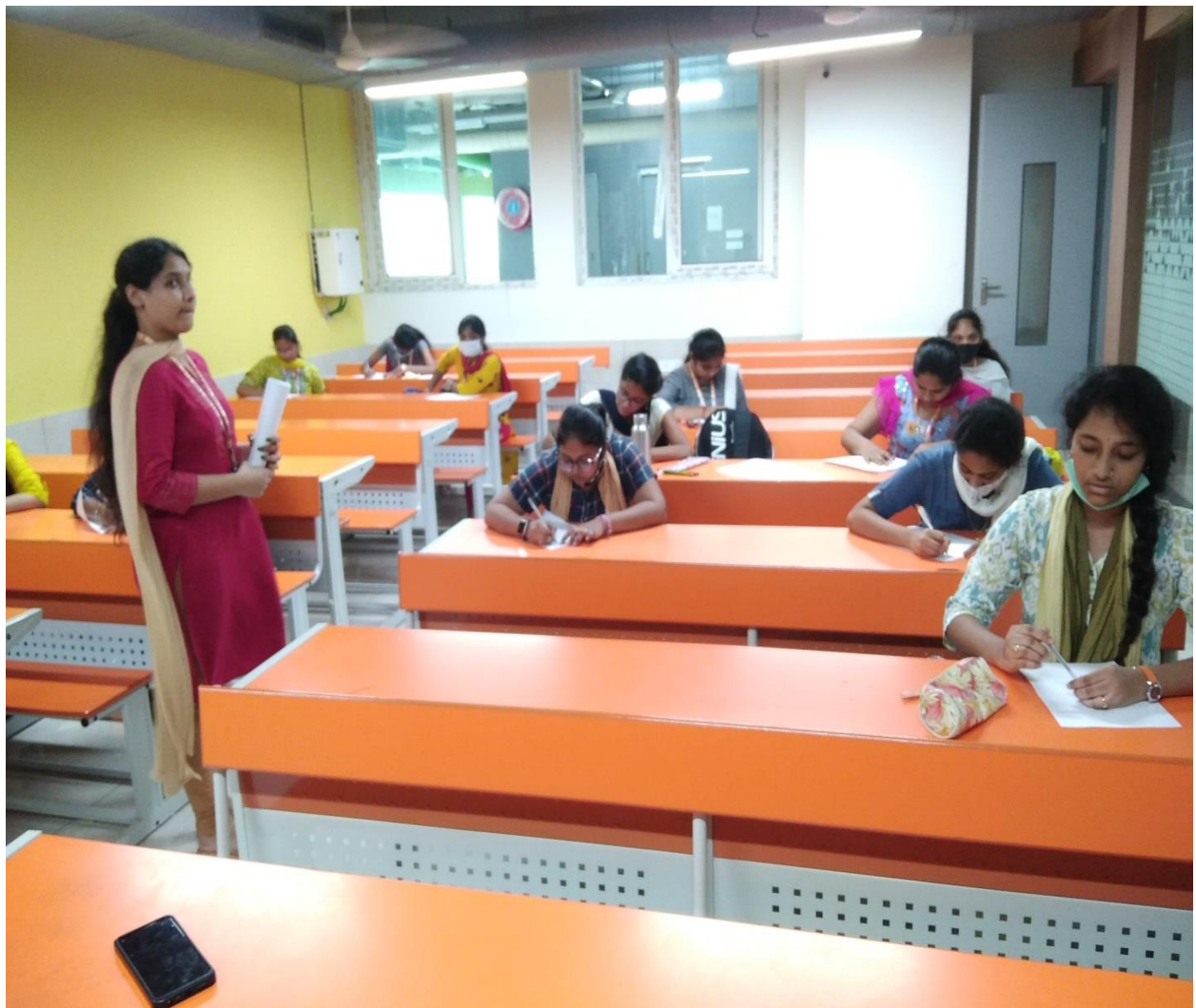
The Professional society activity on “Essay Writing Competition” on 31-10-2021