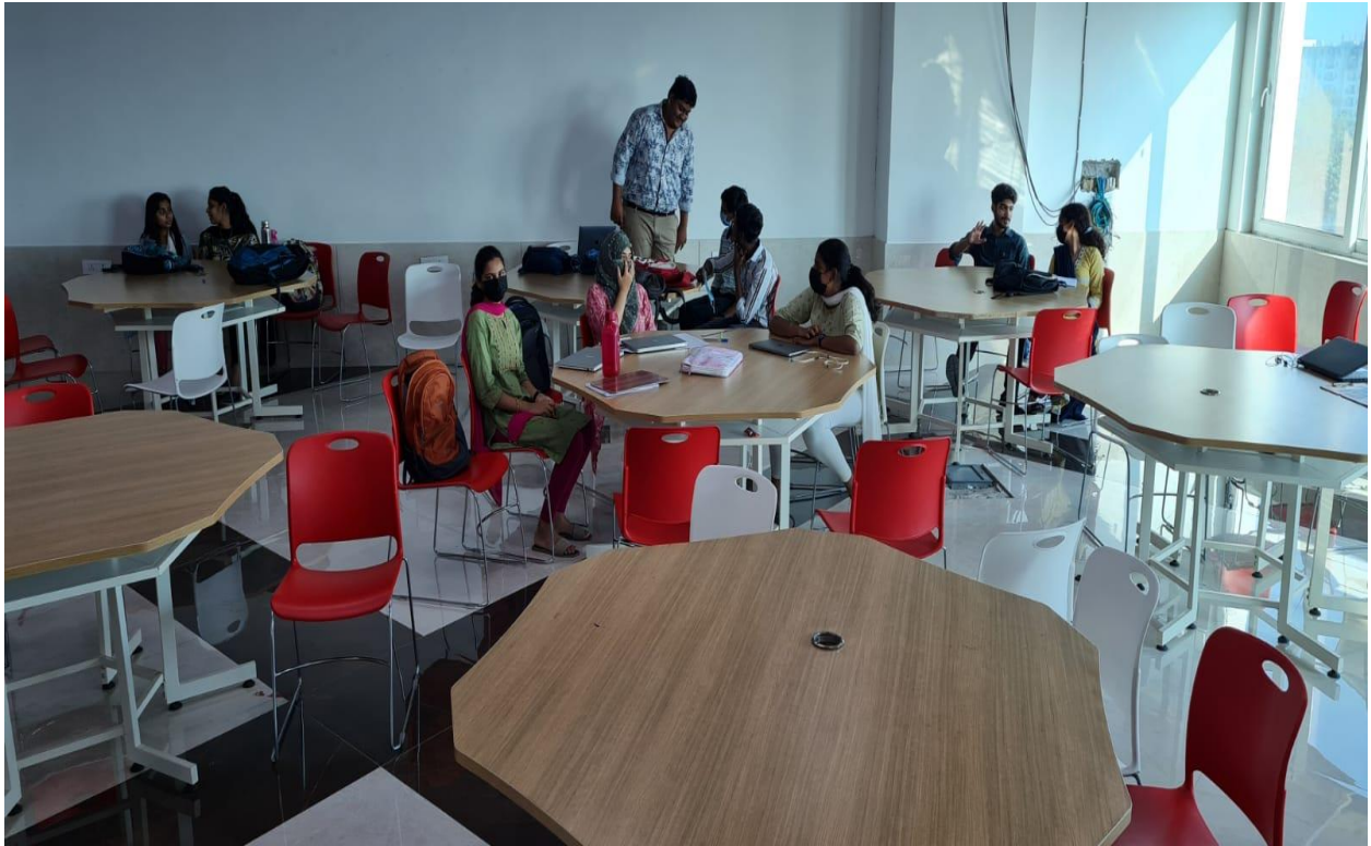
The activity on “Business Quiz” on 31-12-2021