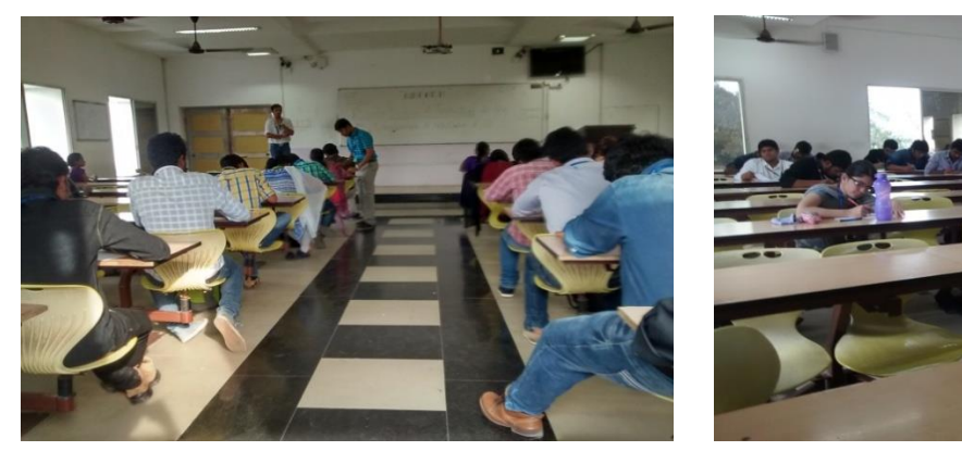
Students participating in Essay writing competitions