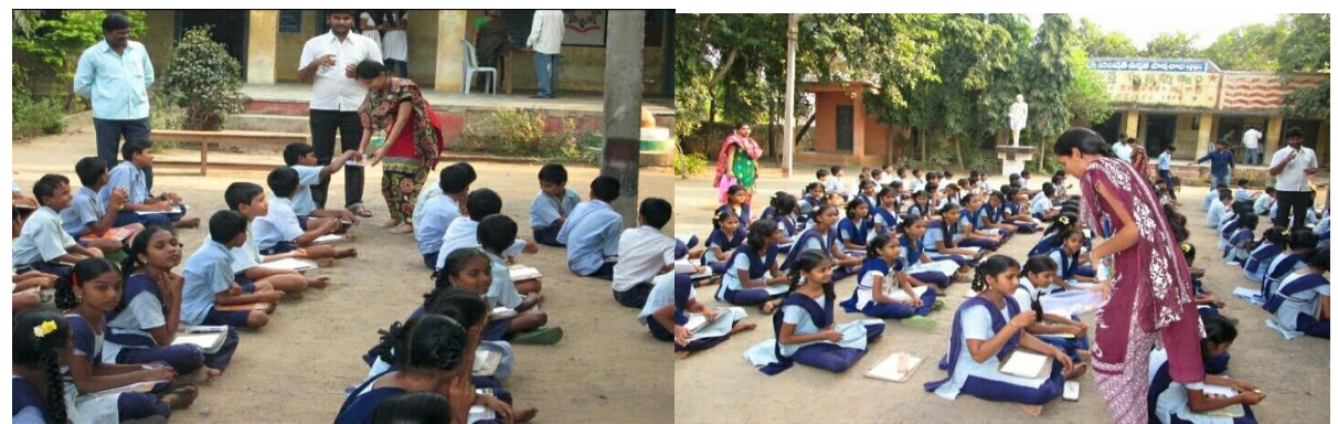
CEA volunteers distributing scales, arisers, pencils and Jamantry boxes to the students