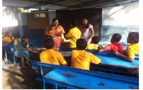
Students doing activity