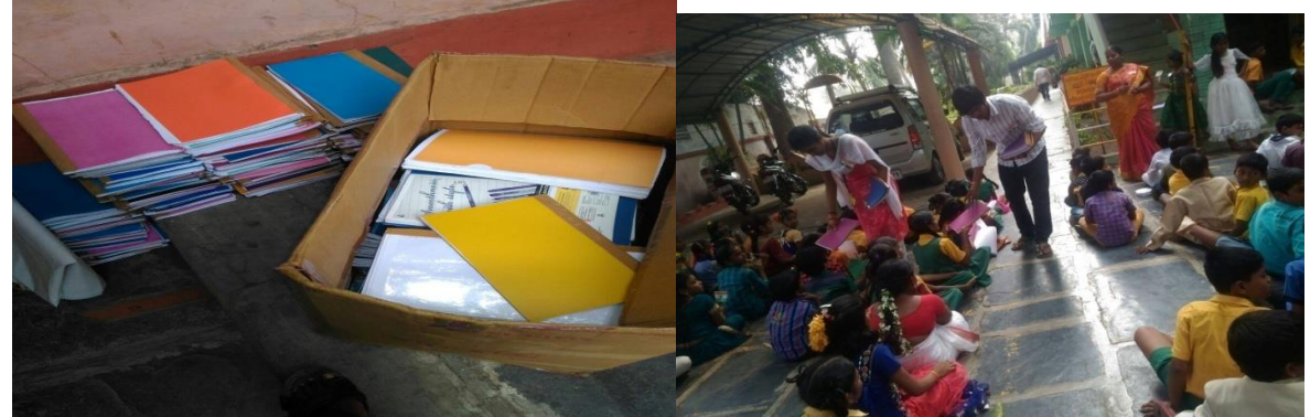
Books ready for Distributing Students distributing books and other materials