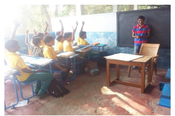
Students guiding the children