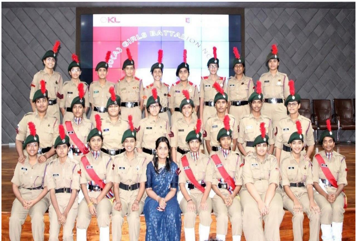
Rank Promotion for Y21 & Y22 Cadets