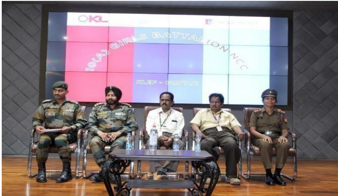
B & C Certificate Distribution on 02-09-2023