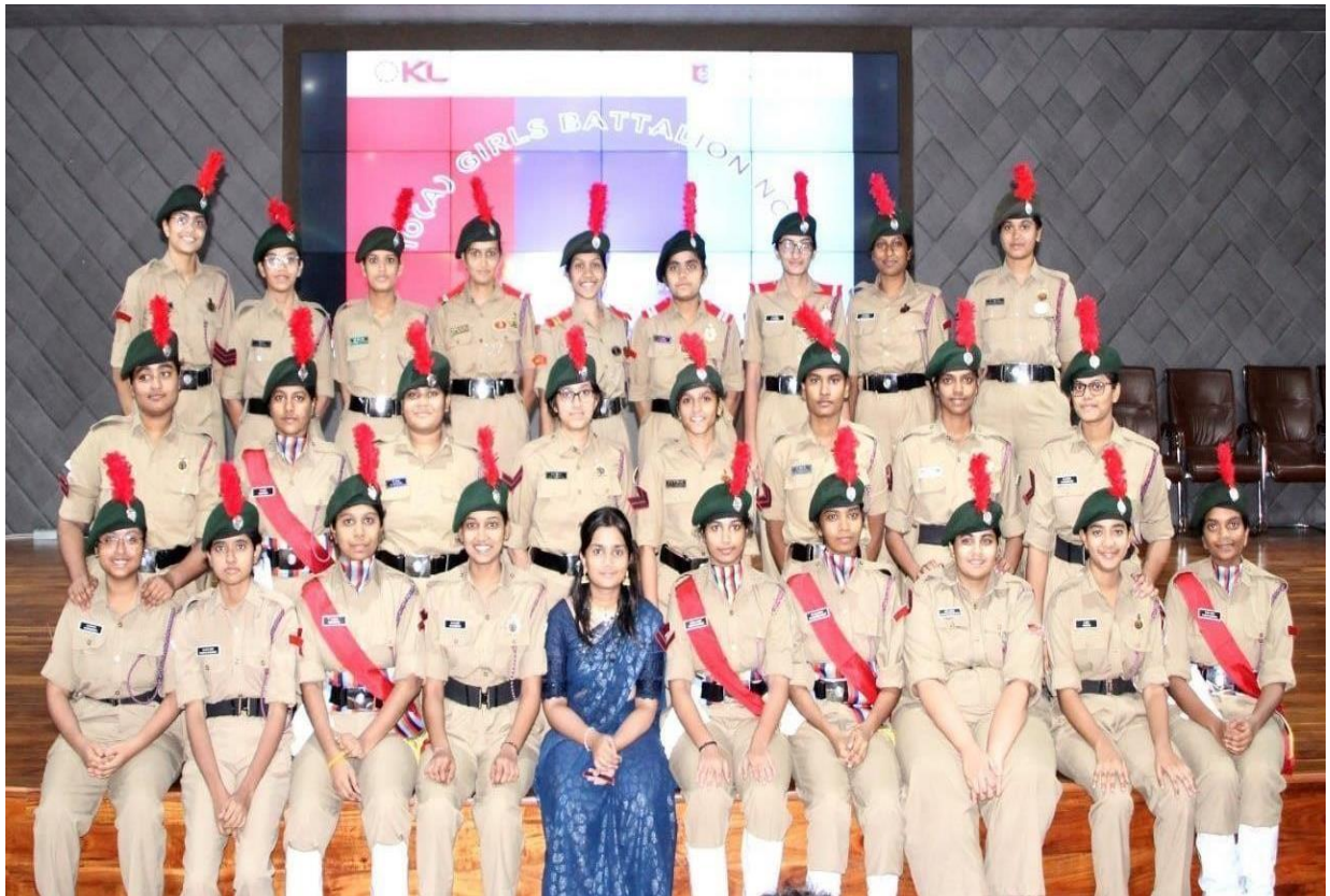
Rank Promotion for Y21 & Y22 Cadets