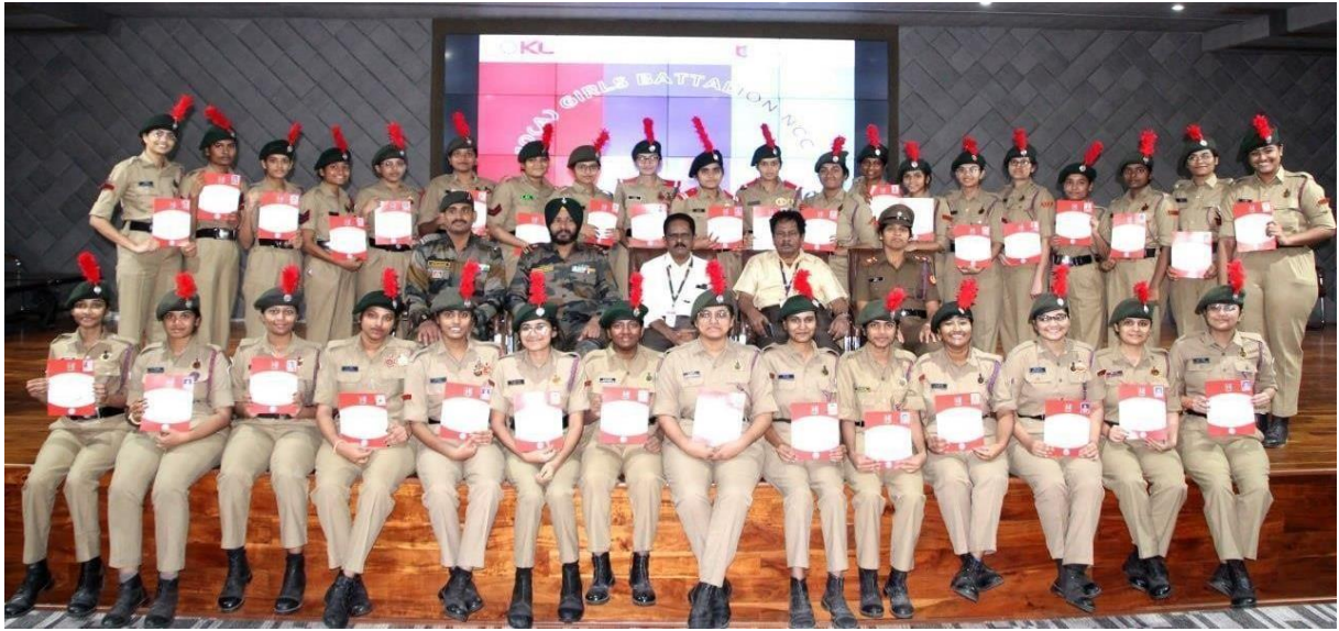
Y21 Cadets Received B Certificates.