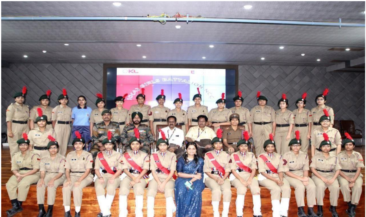
Group photo on Rank Promotion Ceremony