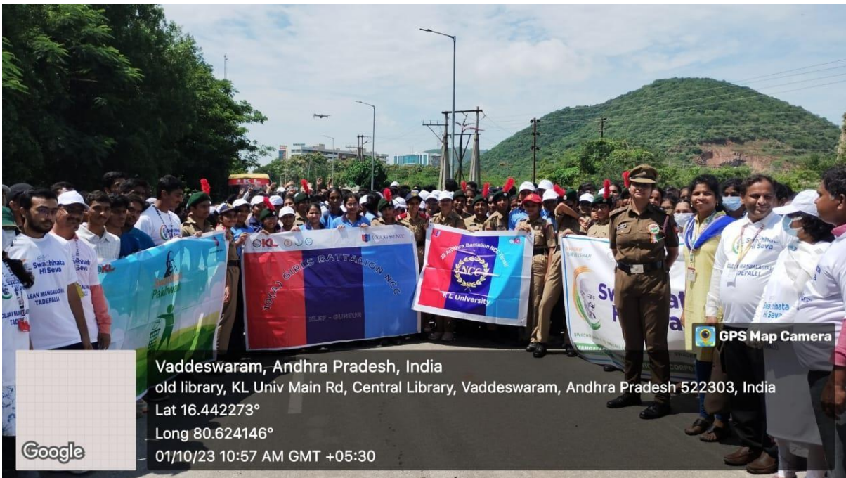
Cadets conduct rally on 1-10-2023