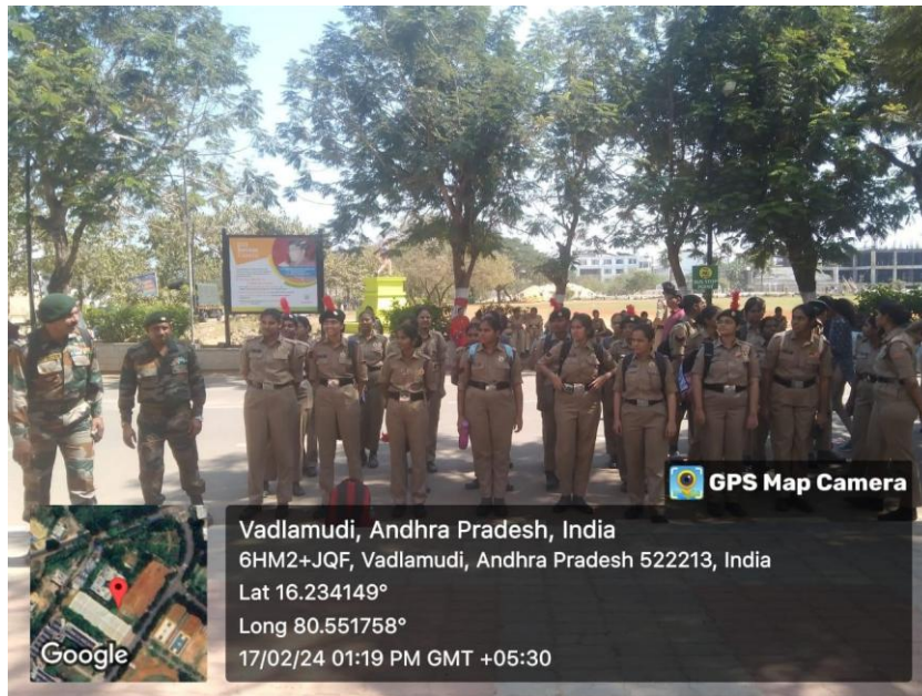
Cadets during their C Certificate Exam