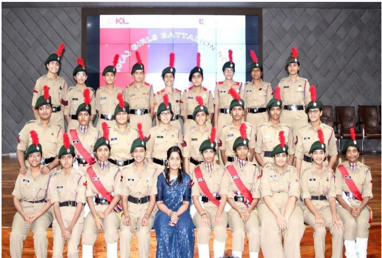
Rank Promotion for Y21 & Y22 Cadets