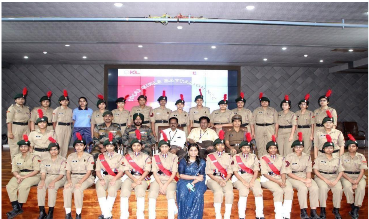
Group photo on Rank Promotion Ceremony