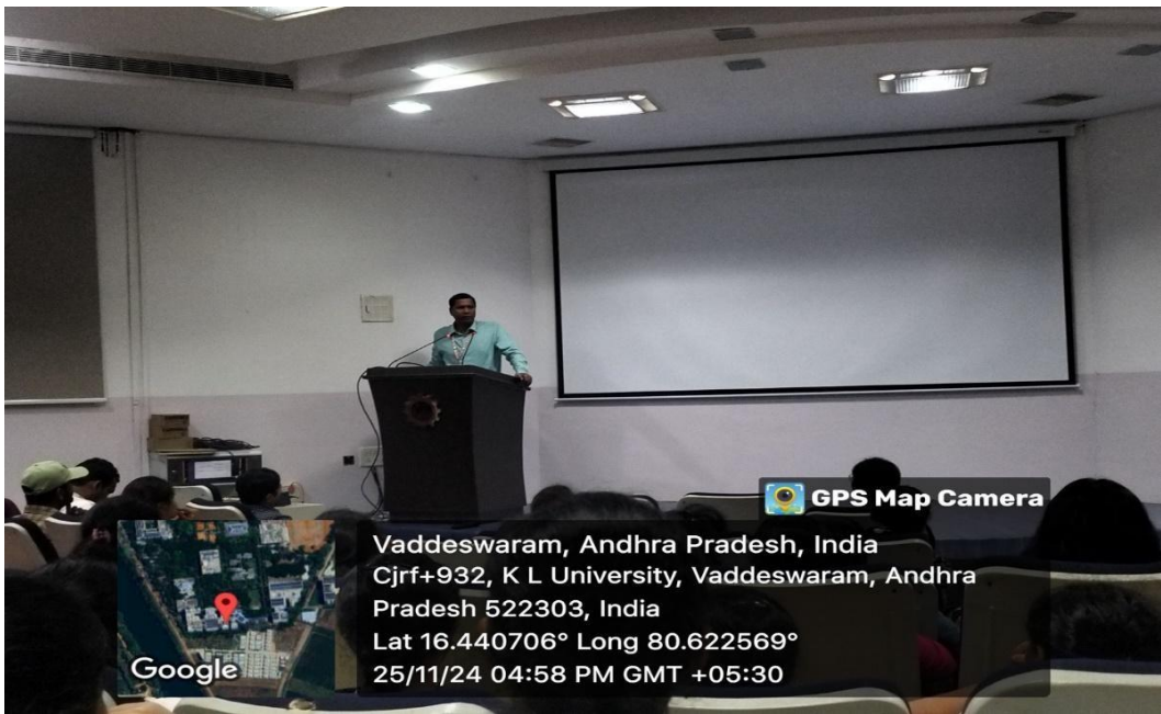
Speech by KRS PRASD Sir