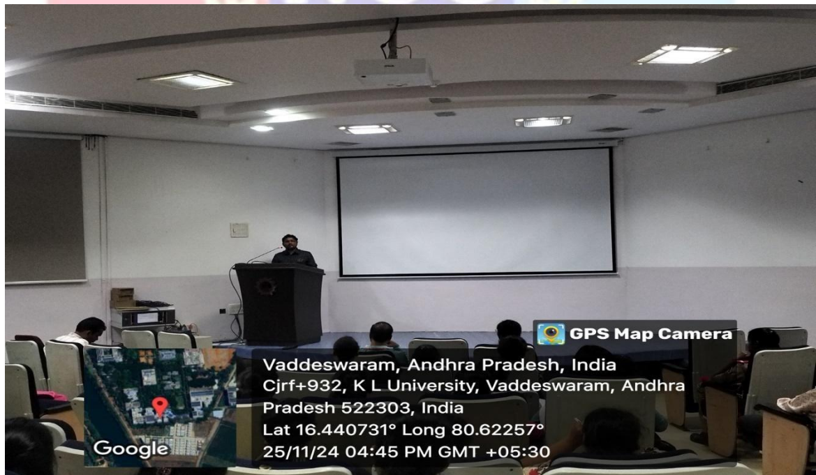
Speech by Tahsildar