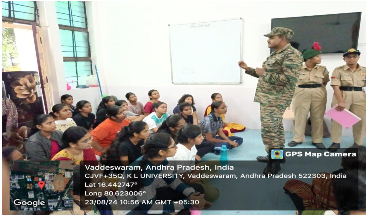
Explaining about NCC by PI Staff to Y24 batch