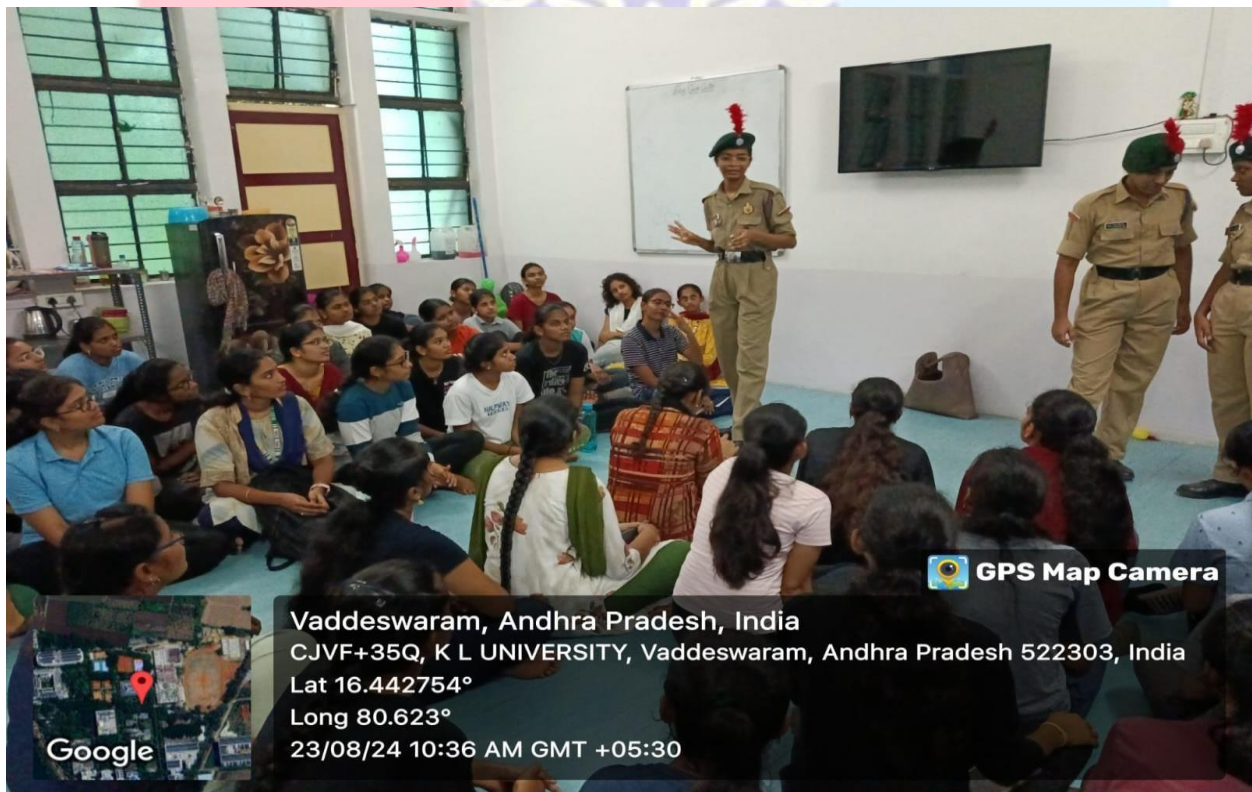
New batch Recruitment on 23-08-2024