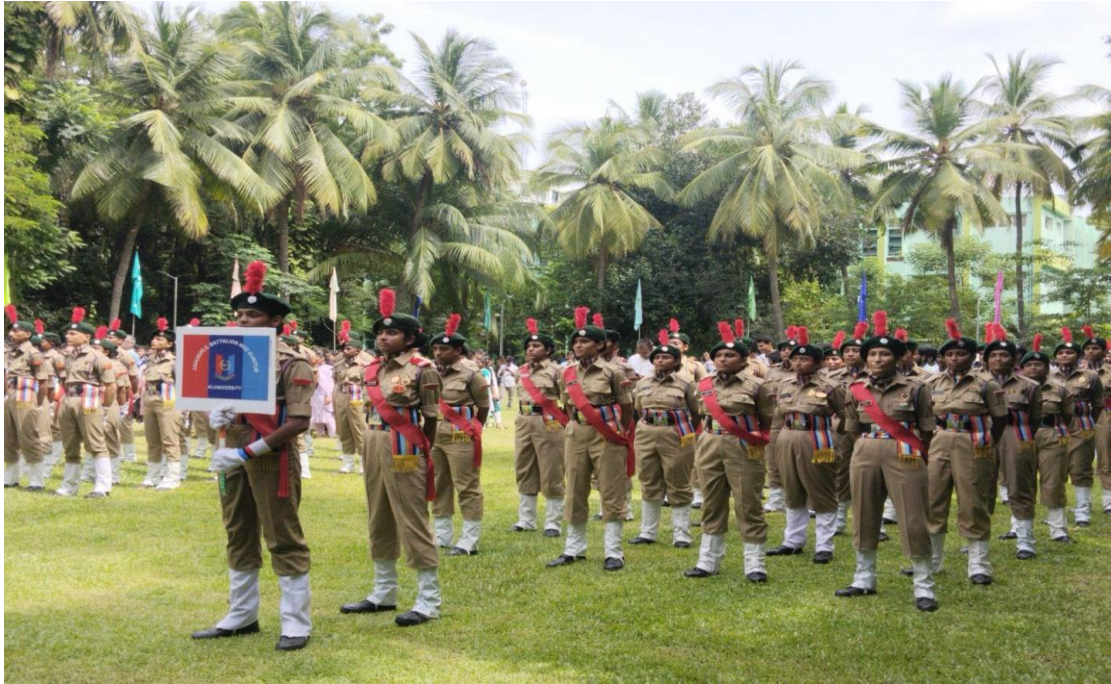
10(A) Girls BN NCC KLEF Contingent