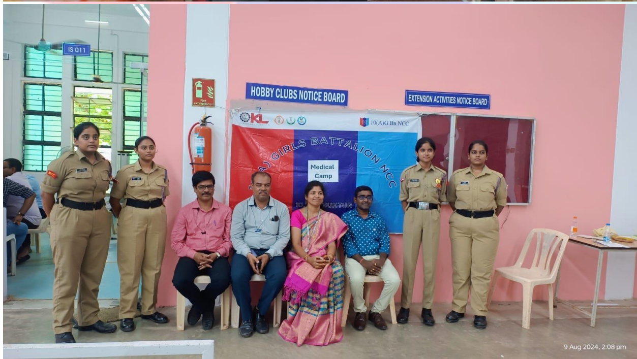
Cadets participated in the medical camp on 09-08-2024