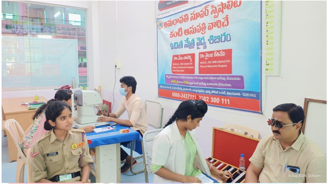
Cadets doing medial service to the people on 09-08-2024