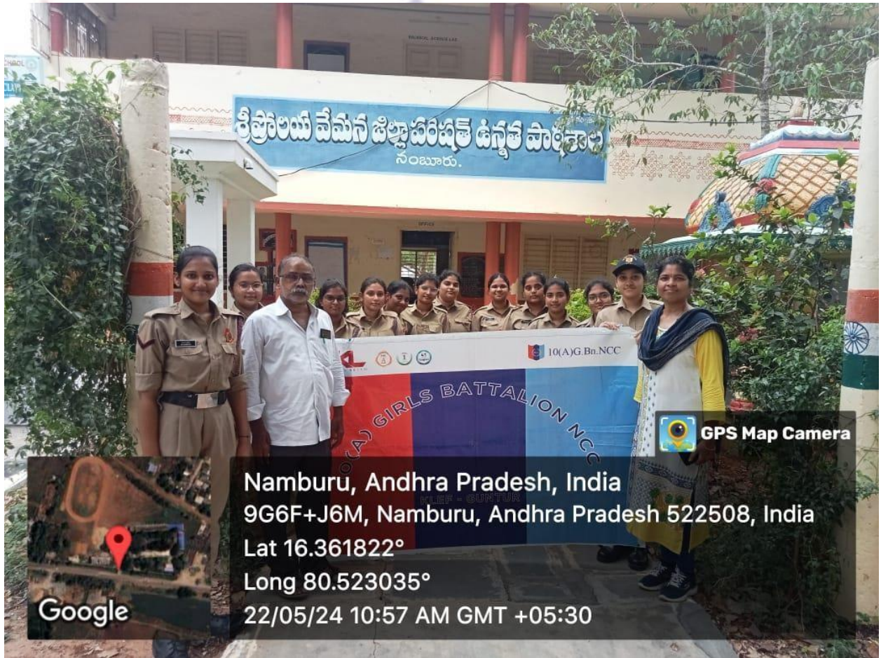
Cadets conduct awareness program on save earth & avoid plastic on 22-05-2024