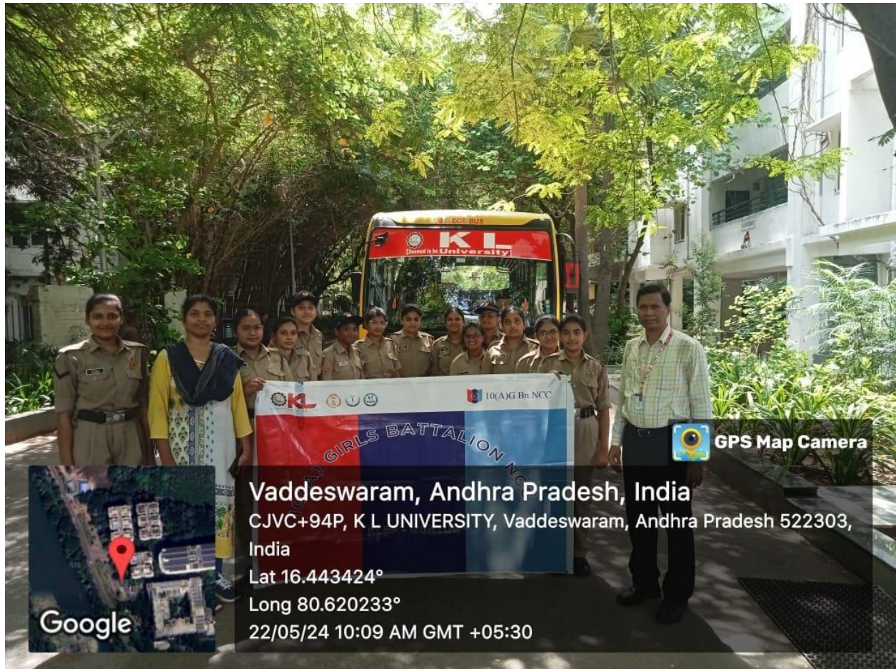
Cadets participating in Bio Diversity program on 22-05-2024