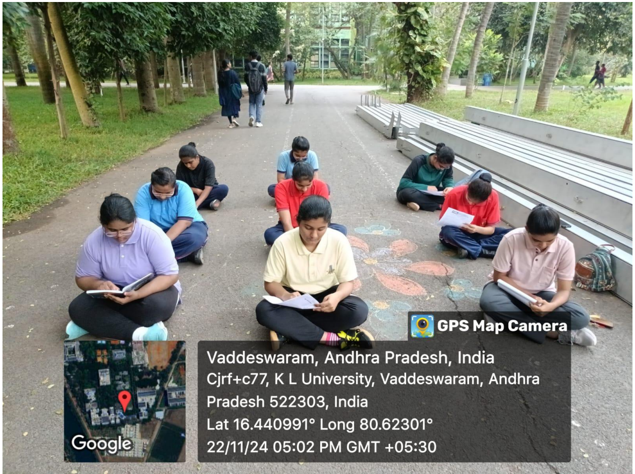
Essay writing competition conducted to the cadets on 22-11-2024