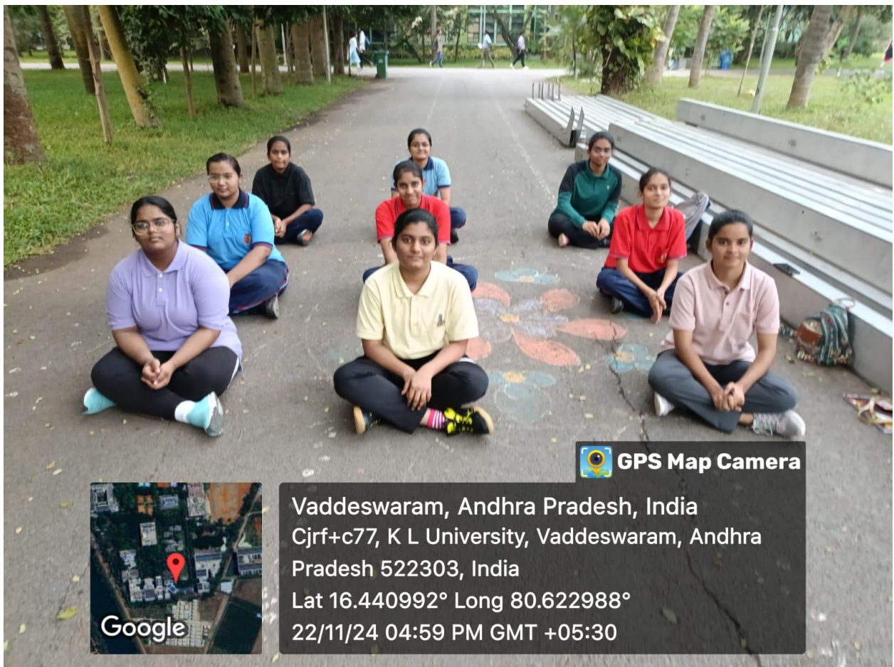
Cadets participated in quiz competition on the eve of communal Harmony event on 22-11-2024