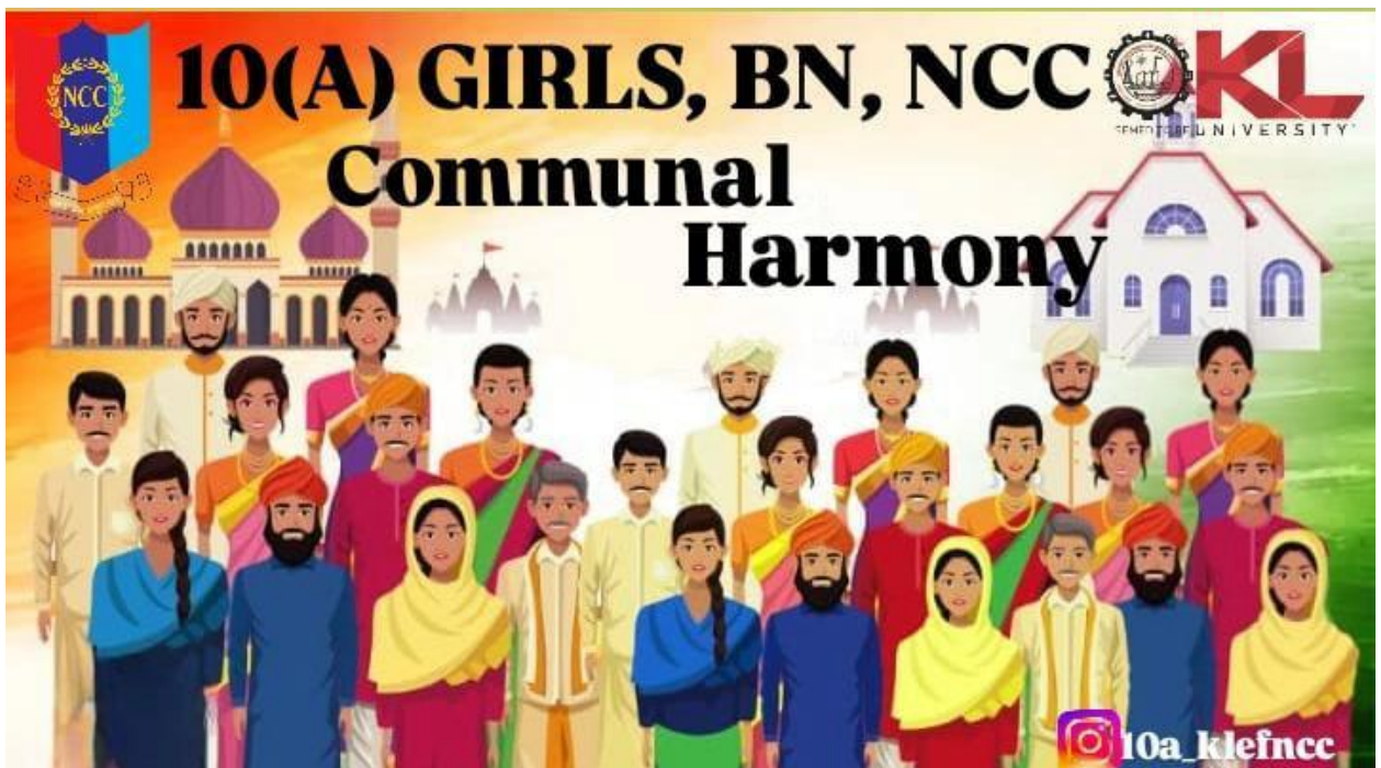
Communal Harmony Poster Designed by our 10(A) Girls BN NCC KLEF Cadets