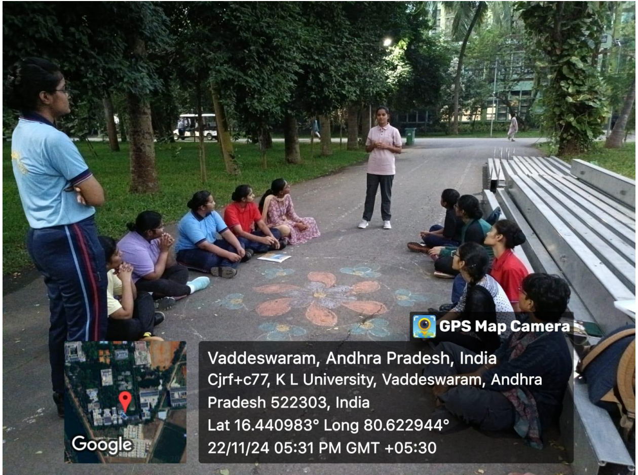
Cadets participated in the Elocution competition on 22-11-20204