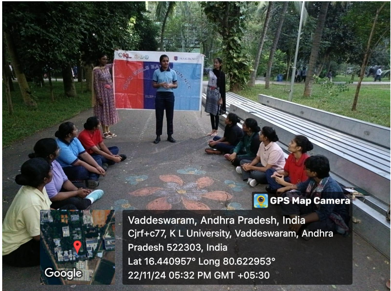
Cadets actively participated in the event on 22-11-2024