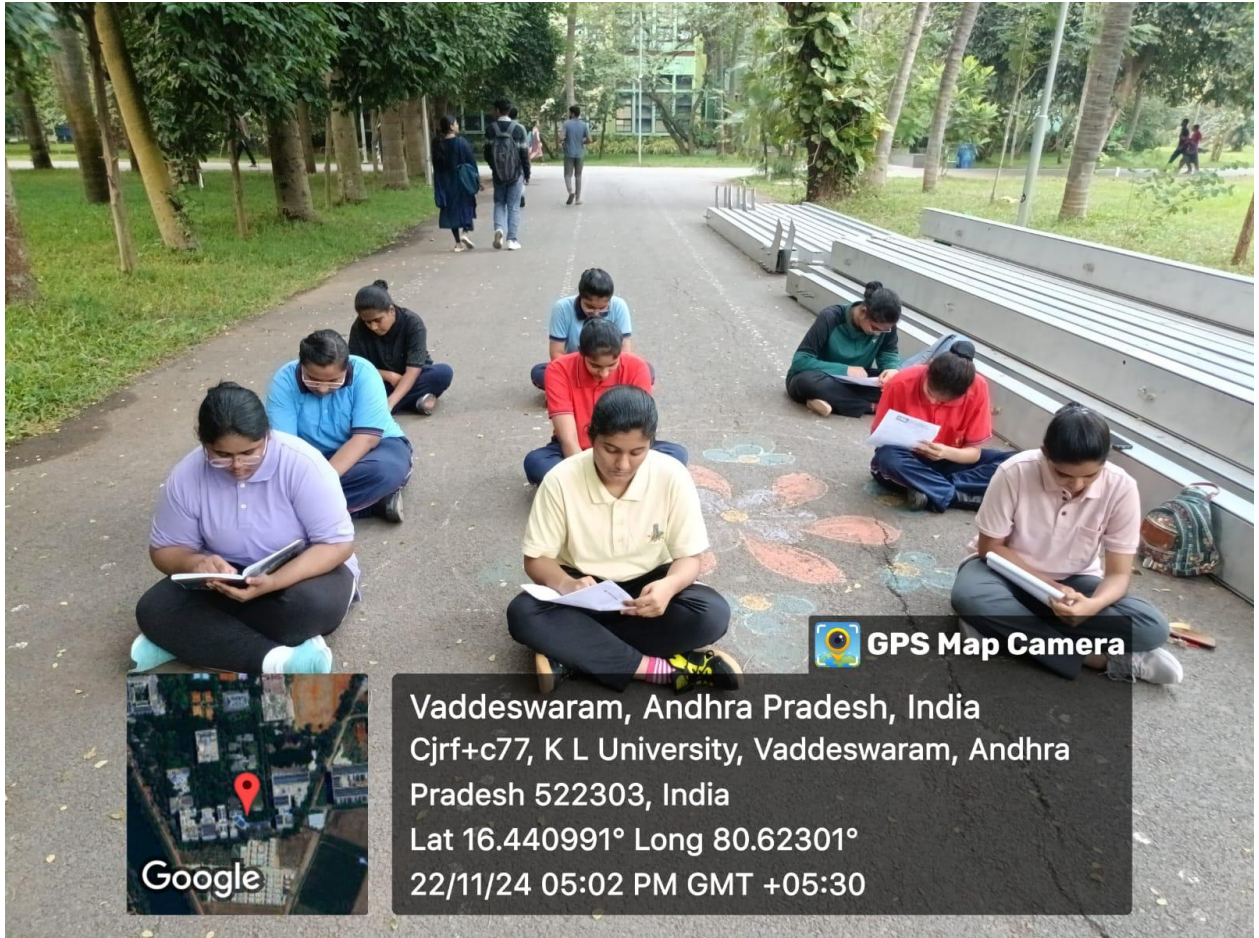
Cadets participate in the essay writing competition on 22-11-2024