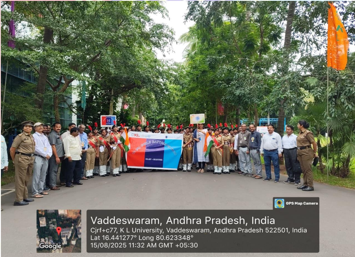
Vaddeswaram, Andhra Pradesh, India Cjrf+c77, K L University, Vaddeswaram, Andhra Pradesh 522501, India Lat 16.441277° Long 80.623348° 15/08/2025 11:32 AM GMT +05:30