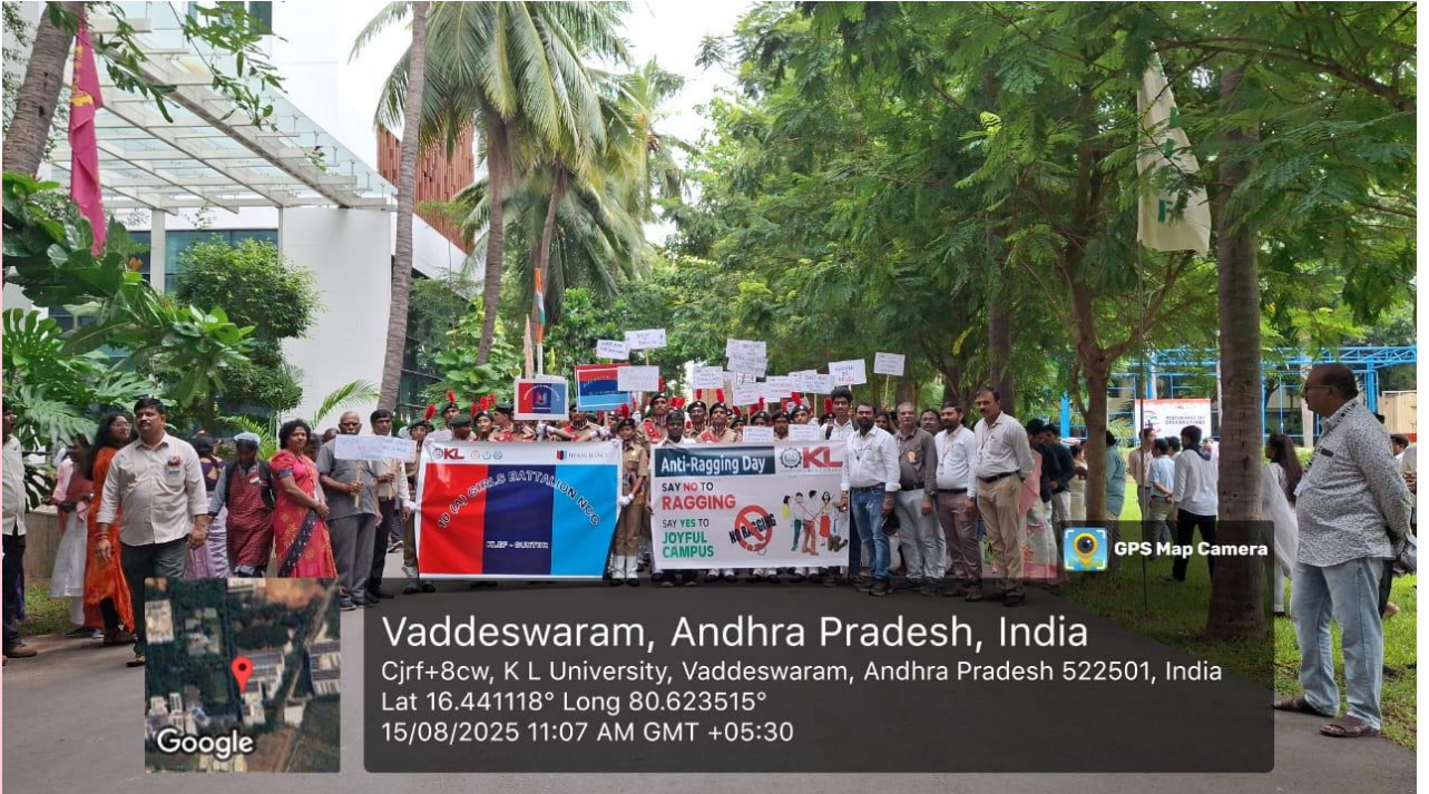
Vaddeswaram, Andhra Pradesh, India Cjrf+8cw, K L University, Vaddeswaram, Andhra Pradesh 522501, India Lat 16.441118° Long 80.623515° 15/08/2025 11:07 AM GMT +05:30