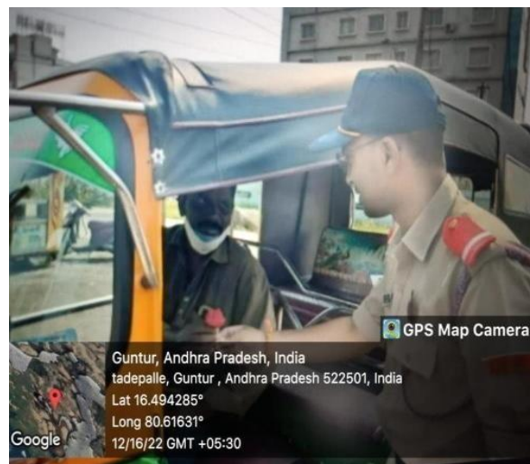
Students and NCC Officers Creating awareness on Seat Belt and Helmet on The Day Of Vijay Diwas on 16.12.2022