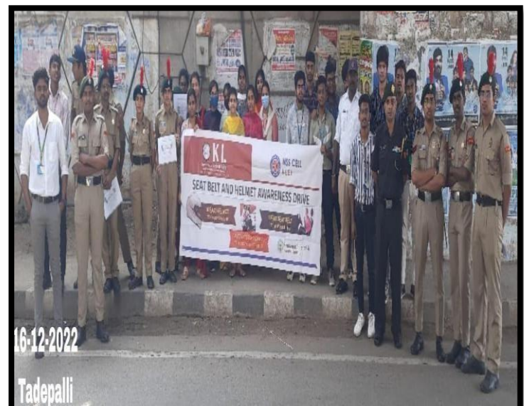
Students and NCC Officers Creating awareness on Seat Belt and Helmet on The Day of Vijay Diwas on 16.12.2022